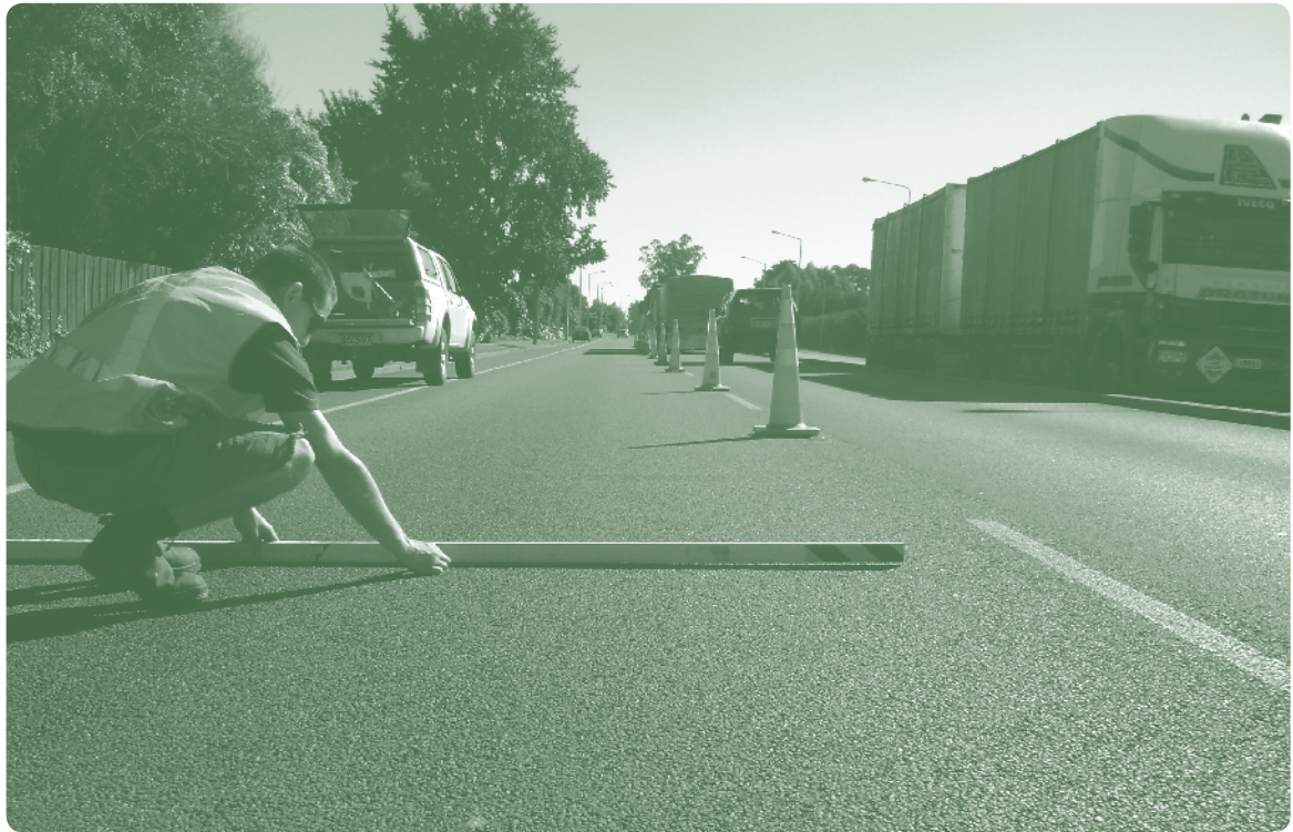
Ongoing road trials on State Highway 1 are demonstrating the satisfactory performance of EMOGPA surfacing 'in the field'

ISSN 1174-0523 (print) ISSN 1174-0566 (online)