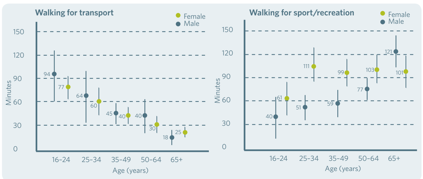
Figure 1 Time spent walking during previous seven days (Active New Zealand Survey 2007/08)

Charles says, 'The message for users of results from the surveys is to be aware that the two surveys may report very different results for things with similar labels, such as 'total walking' or 'total walking/jogging'. The surveys in fact record very different types of activities and users need to allow for this when attempting comparisons between them.'