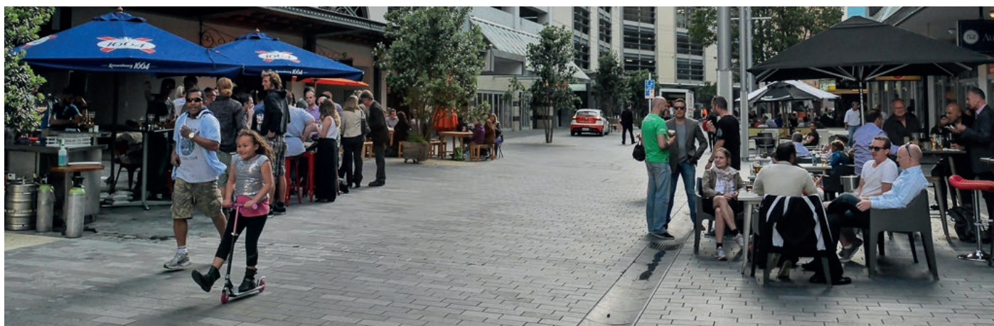
Road space in Auckland's Fort Street area has been reallocated to prioritise pedestrians and created a socially vibrant inner city area

The spreadsheet has two worksheets; the first worksheet lists research reports with associated key words and the second lists research reports with the report abstracts.