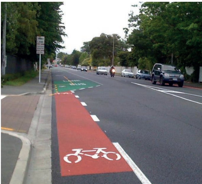
Permanent and temporary reallocation of kerbside parking on Papanui Road in Christchurch has improved the safety and efficiency of travel for public transport and people on bikes (Source http://viastrada.nz/project/2010/christchurch-city-goes-green )

Consistently evaluating kerbside parking reallocation against the same set of costs and benefits, and contextual elements, across New Zealand is expected to reduce misconceptions about negative impacts on businesses, provide a robust evidence base for the net benefits of reallocation, reduce reliance on overseas and anecdotal evidence and contribute to best practice decision making for future reallocation projects. (p9).