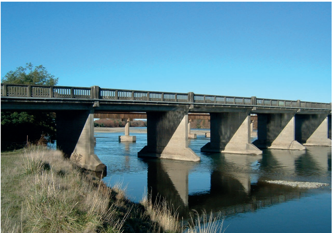
Wairua River Bridge, is an example of an integral bridge discussed in the research report

Therefore, an integral bridge can be fully or semi-integral at the abutments and/or at the piers.