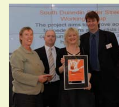
Winning the 2006 NZ Community Safety and Injury Prevention award for 'outstanding community safety and/or injury prevention'