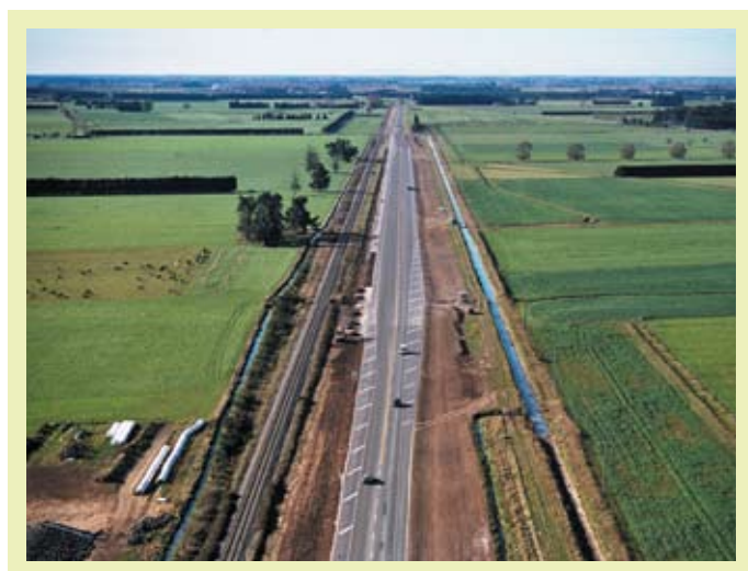
Recently completed passing lanes on SH1 south of Ashburton.