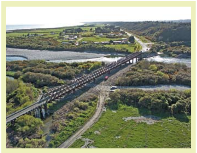
Work will start in the coming year on replacing the aging Arahura road-rail bridge on SH 6 near Hokitika.