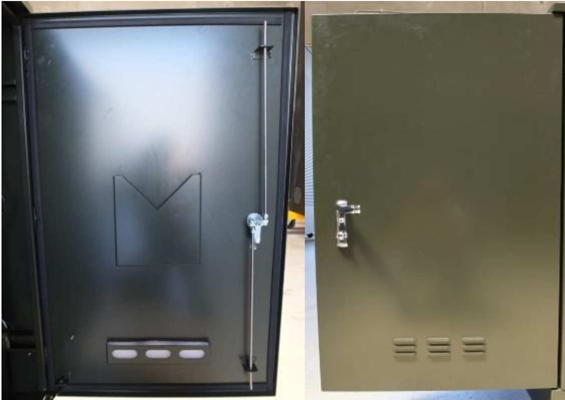
Figure 5: Typical door arrangement showing the document pocket and ventilation grille.