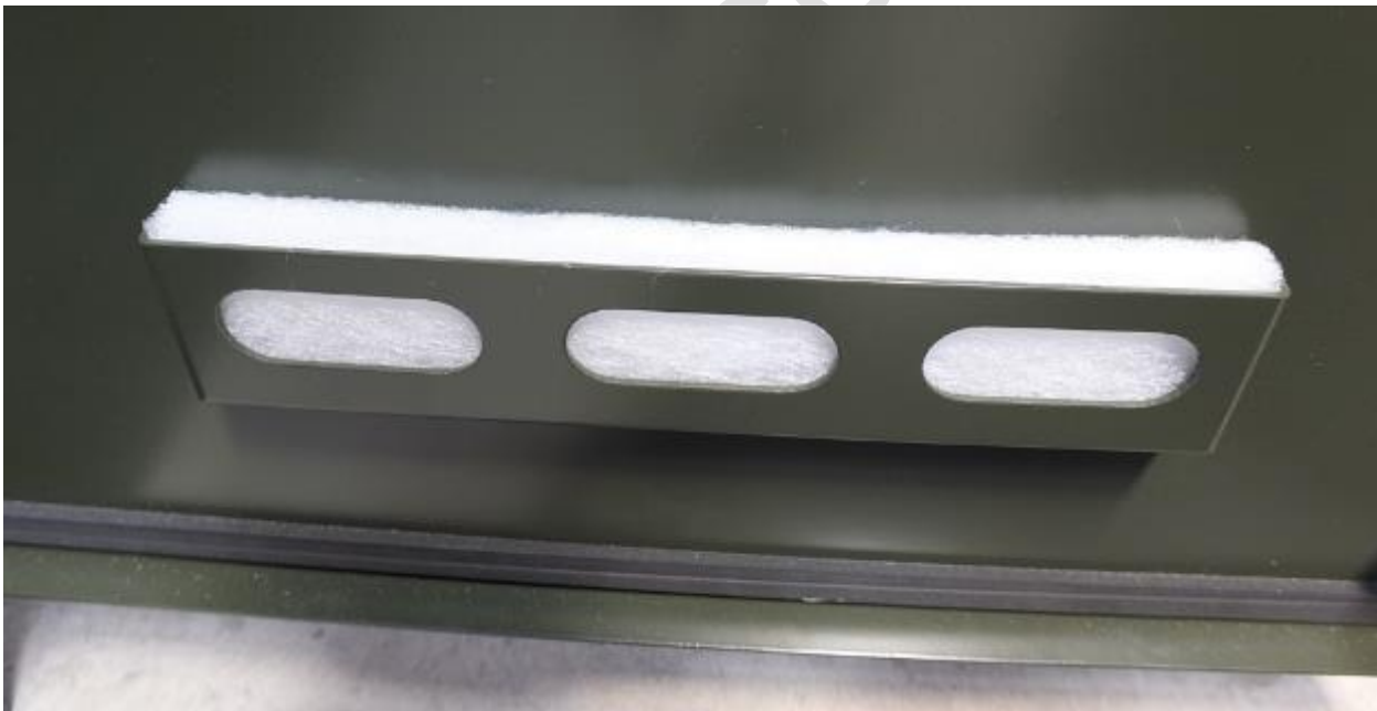
Figure 6: Example of internal ventilation grille dust and insect filter