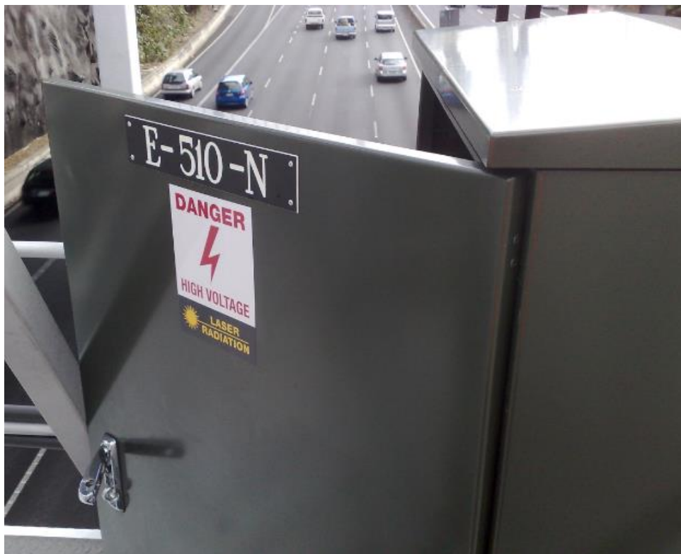
Figure 3: Cabinet that is not visible from the road

Some cabinets cannot be seen from the road, such as Figure 3 that is mounted on a gantry. The (old style three-digit) label is attached on the door with the electricity and laser warning label.