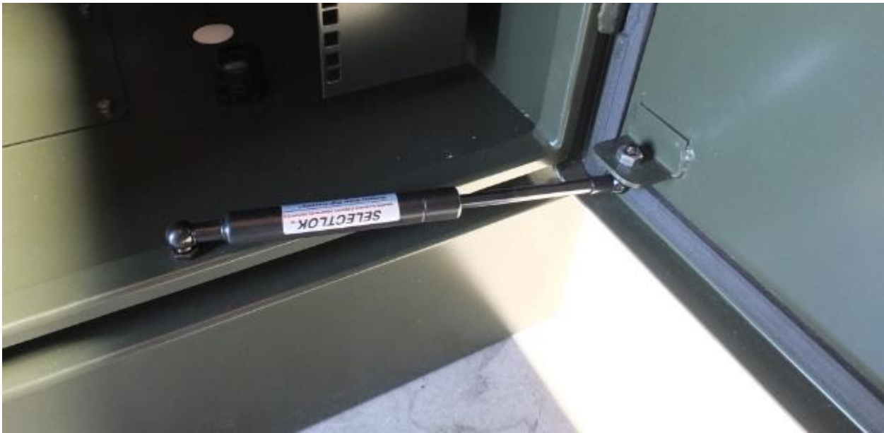
Figure 7: Example of a gas strut door stay. Steel rod stays may also be used