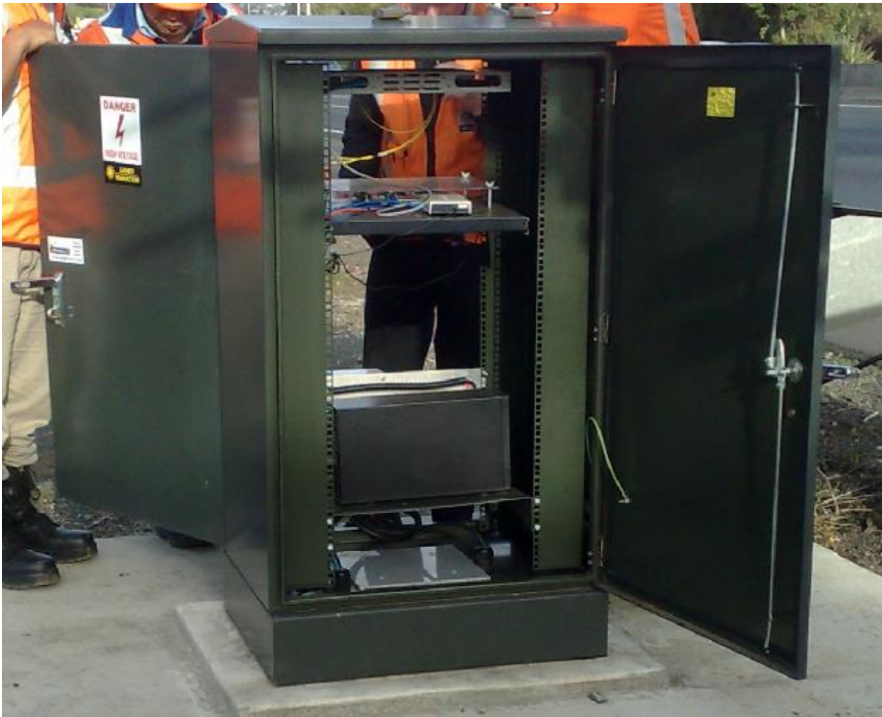
Figure 4: Rear of a cabinet

Figure 4 shows a rear of a cabinet under construction illustrating the vertical fixing rails for 19-inch racks, the door earth strap, the three-point locking system in the open position.