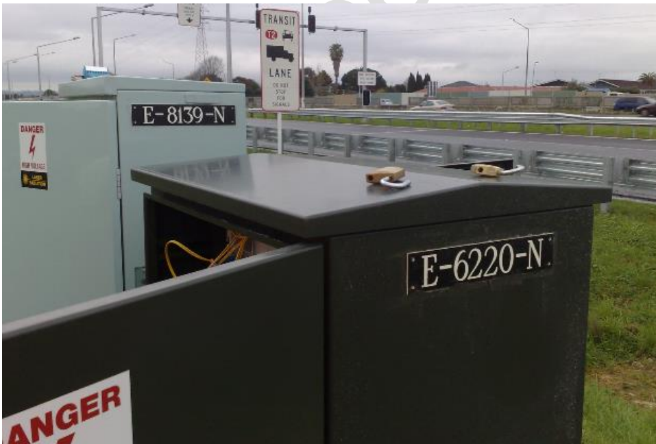
Figure 2: Communications cabinet E-6220-N and Ramp Signals Cabinet E-8139-N with their identification labels facing the approaching traffic