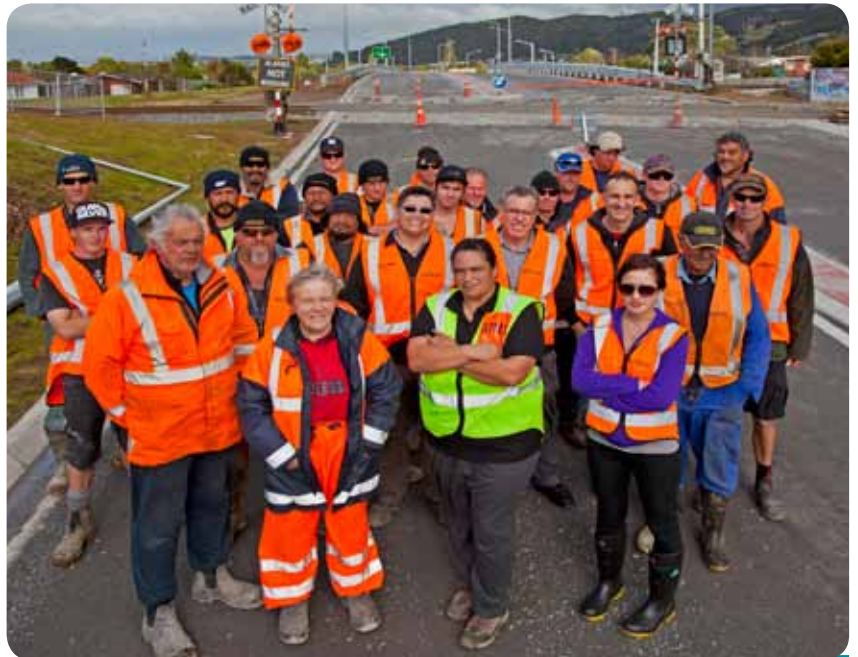
The project team, July 2011