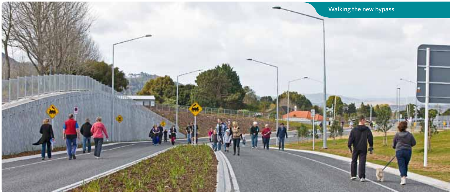
Walking the new bypass