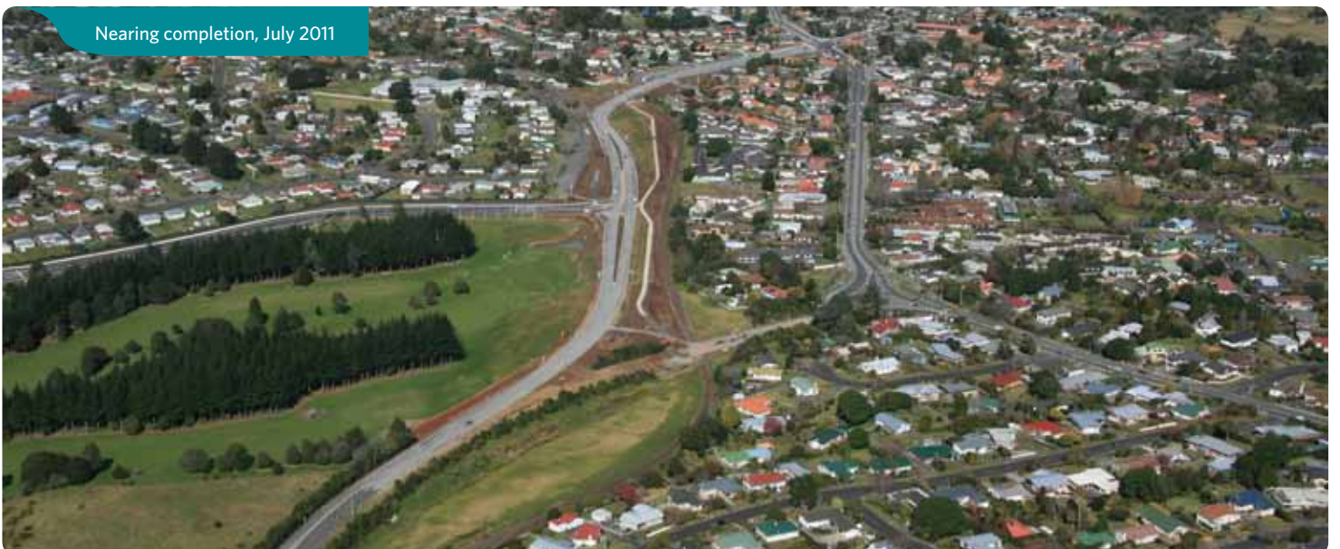
Nearing completion, July 2011