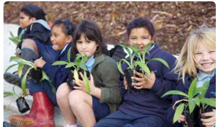
Whau Valley School planting day, July 2011