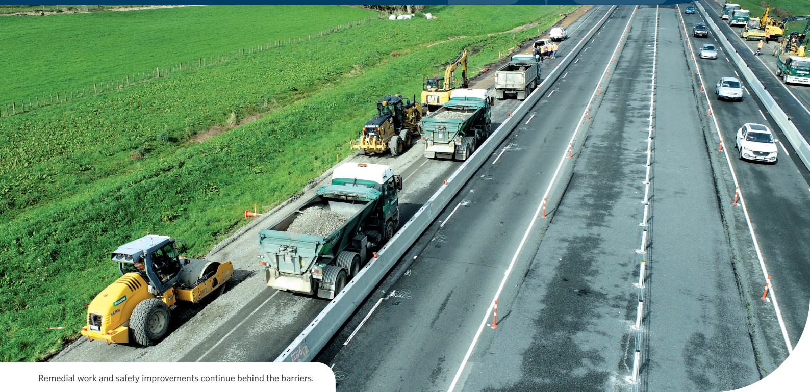
Remedial work and safety improvements continue behind the barriers.