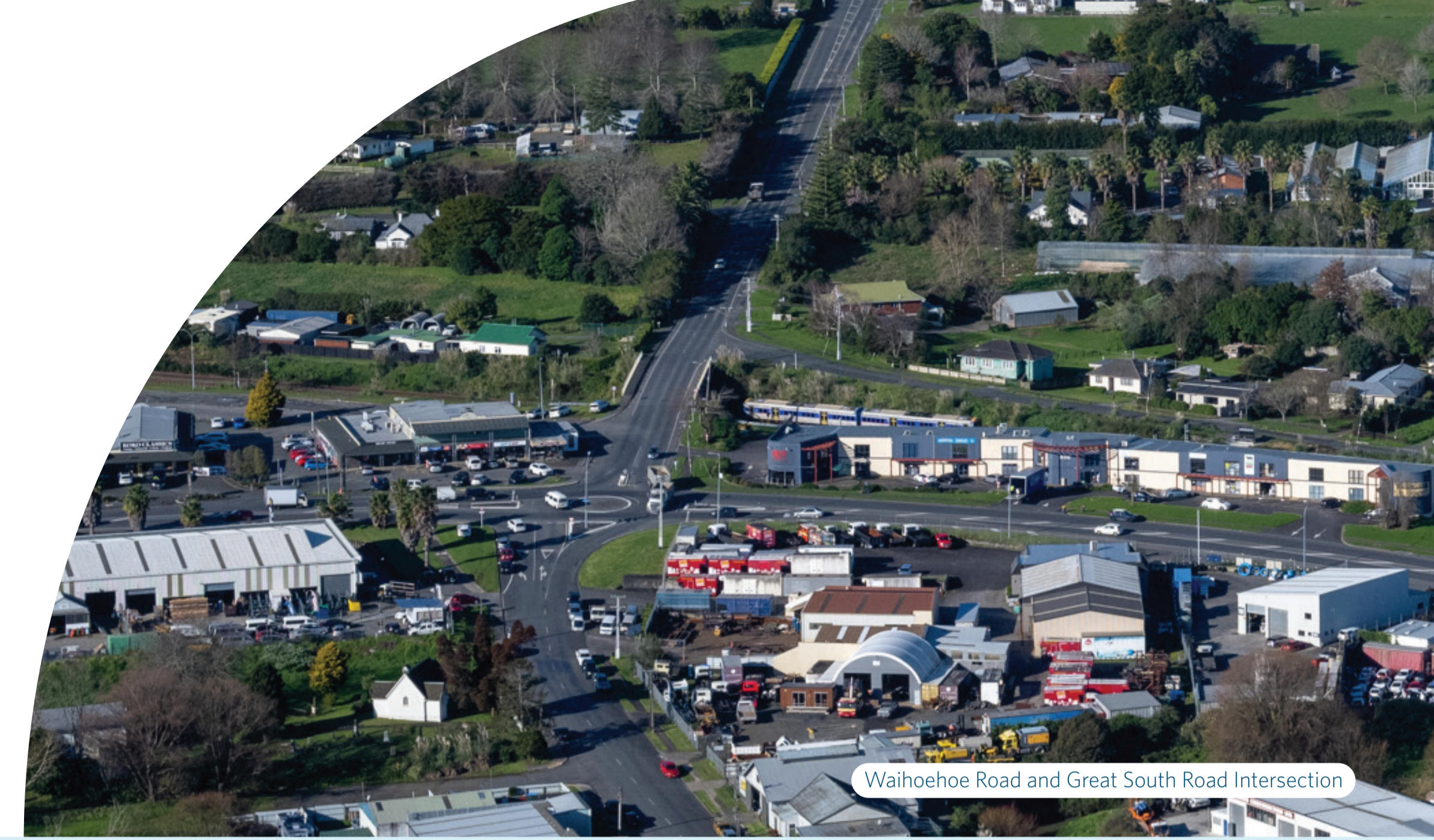
Waihoehoe Road and Great South Road Intersection

We are proposing an upgrade of part of Waihoehoe Road under the New Zealand Upgrade Programme to provide growing communities with better transport choices that help people get where they're going safely.