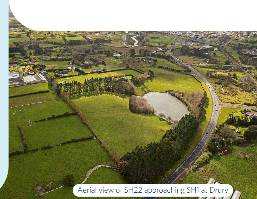
Aerial view of SH22 approaching SH1 at Drury