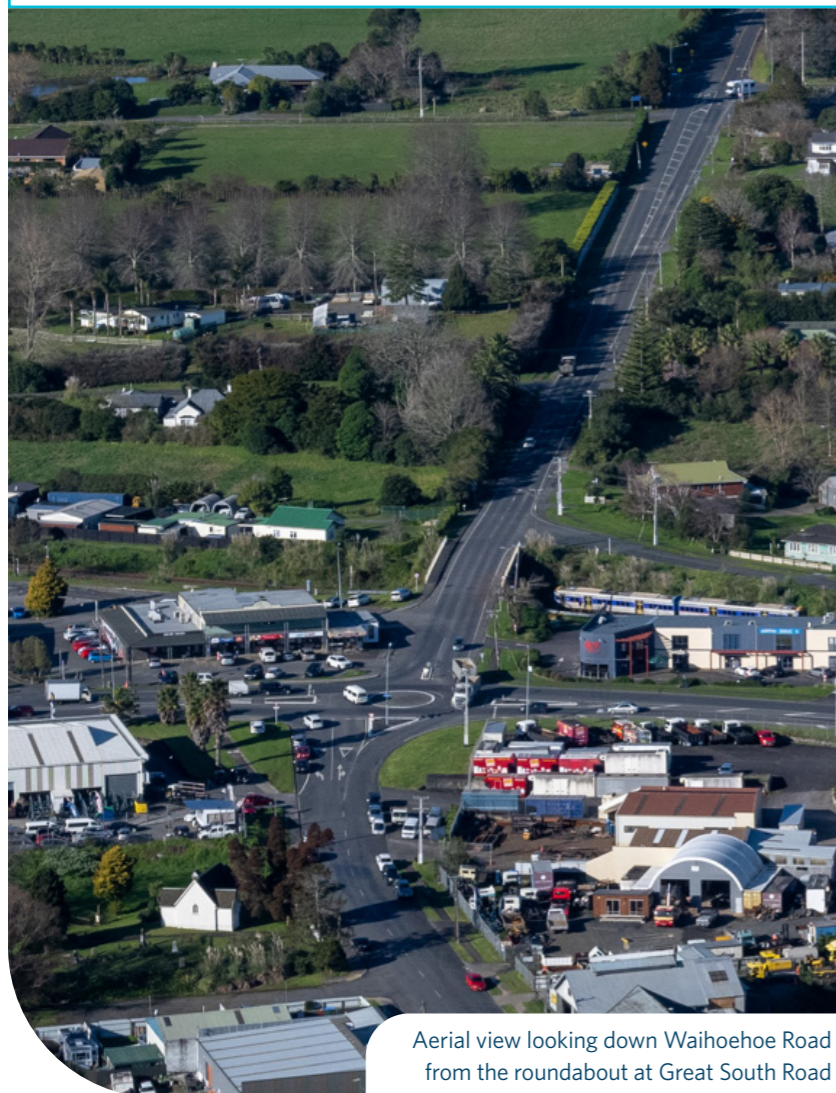
Aerial view looking down Waihoehoe Road from the roundabout at Great South Road