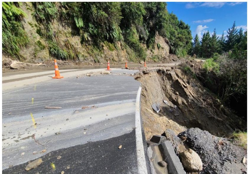
Photo: Cyclone damage at Devil's Corner, March 2023.

During the November closures, TREC will prepare the Devil's Corner site to make it safe and accessible for the people and machinery required for the main works.