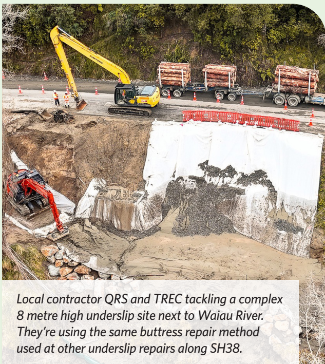
Local contractor QRS and TREC tackling a complex 8 metre high underslip site next to Waiau River. They're using the same buttress repair method used at other underslip repairs along SH38.

The reinstated bank is then hydroseeded. Hydroseeding is when we spray a slurry of seeds, mulch, and fertiliser onto steep slopes to provide stability as well as helping to control dust, erosion, and sediment runoff.