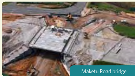
Maketu Road bridge

Construction of the Maketu Road bridge and nearby East Coast Main Trunk (ECMT) rail bridge is well underway with both due for completion in late 2013.