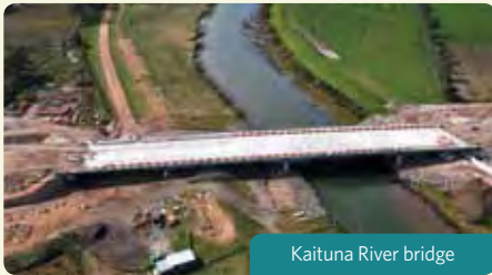
Kaituna River bridge

The Kaituna River bridge was opened to construction traffic in June. The bridge, at 150 metres in length, is the longest of the seven bridges being built on the TEL. It has four lanes, two in each direction, and a pedestrian/cycleway on one side of the bridge.