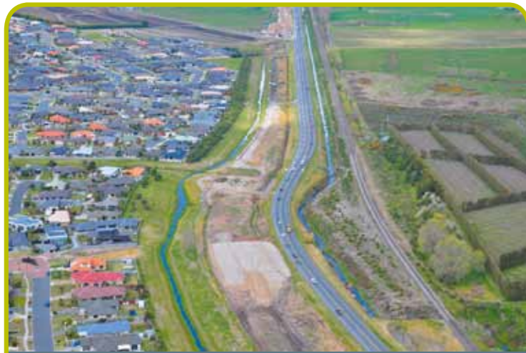
1 SH2 - trial embankment at the Maranui Swale, Bruce Road top left hand corner