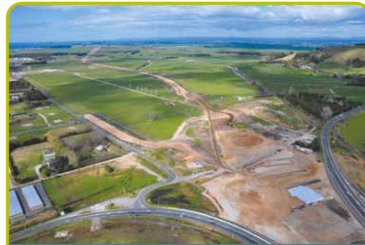
3 SH2 / Domain Road, TEL alignment heading east towards Parton Road