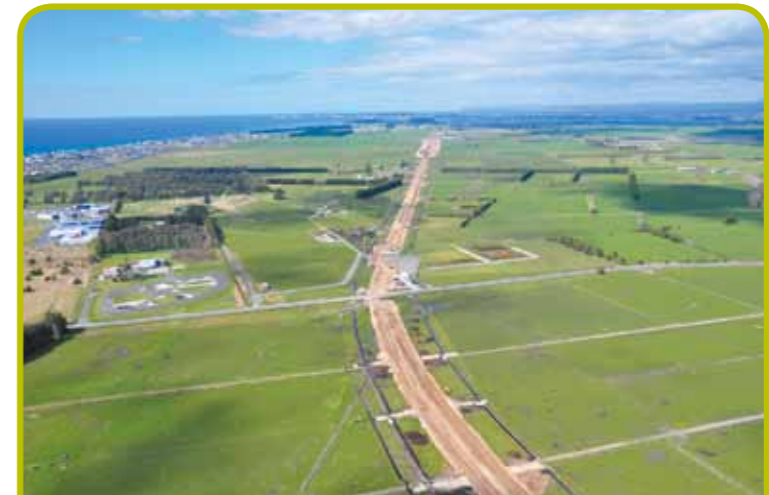
4 TEL alignment crossing Parton Road heading east towards Kaituna River