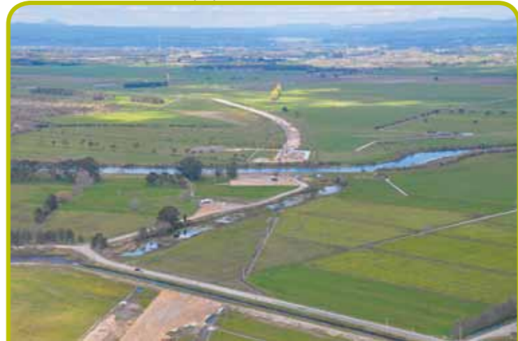
6 Location where TEL crosses Kaituna River heading east towards Paengaroa