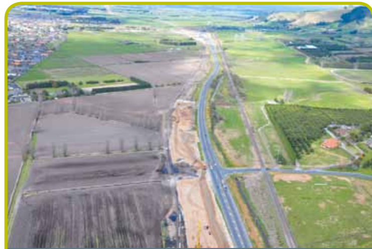
2 SH2 / Kairua Road intersection - Domain Road top of picture