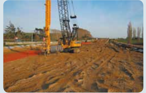
Over 15,000 wicks will be installed alongside SH2 to help drain the water content from the soft soil below.

From now until the end of the project construction activity will continue along SH2 and the NZ Transport Agency and Fulton Hogan HEB Construction Alliance wish to thank motorists for their care and patience when driving through this area.