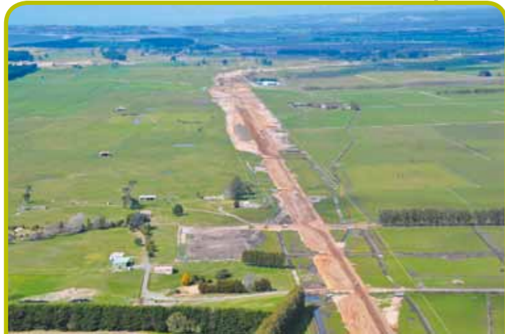
5 TEL alignment heading east towards Kaituna River