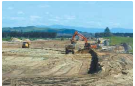
One of many areas the public won't see until the highway opens in 2016. The 'sand cut' is located between Parton Road and Kaituna River.