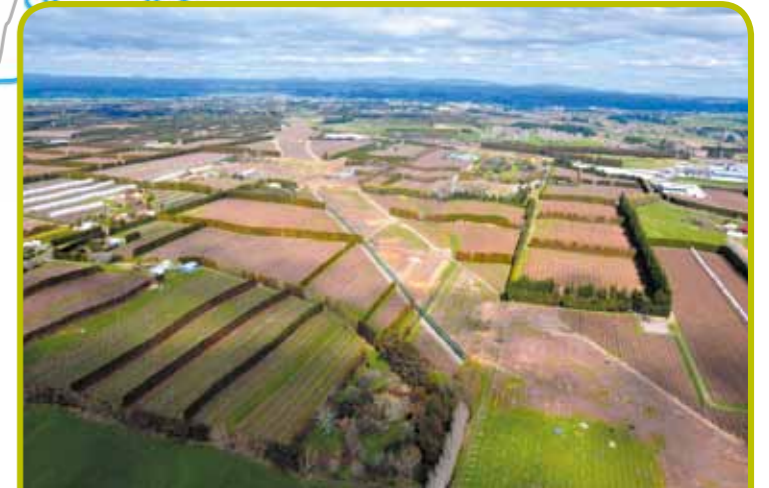
8 Kiwifruit orchard reconfiguration at Paengaroa end of TEL