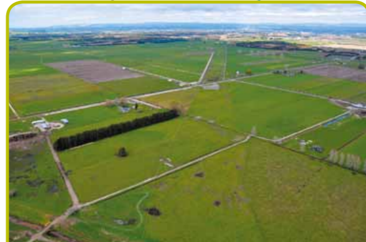
7 TEL alignment crossing Pah Road heading east to Paengaroa