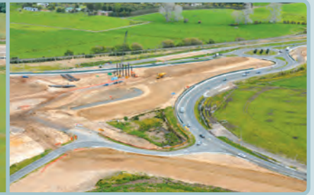
Domain Road interchange