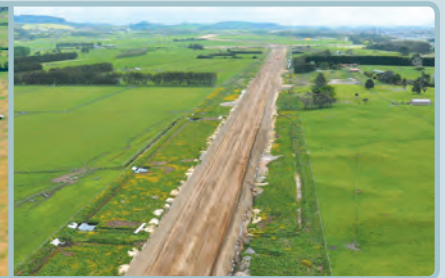
East of Parton Road