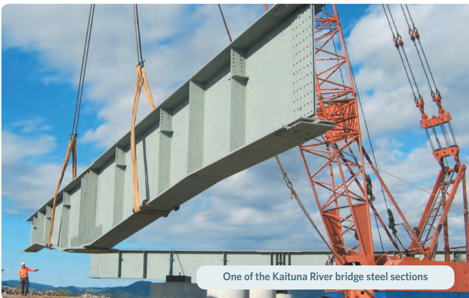
One of the Kaituna River bridge steel sections

A bridge is being constructed to take the Tauranga Eastern Link over Maketu Road. A small section of Maketu Road will be diverted temporarily onto a new section of Te Tumu Road to allow construction activity to continue.