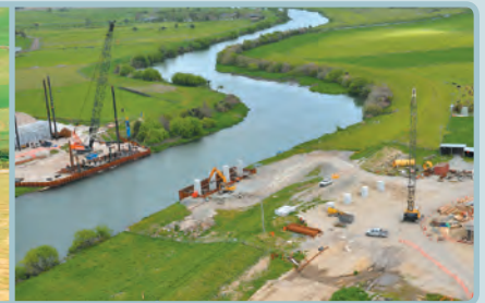
Kaituna River bridge