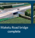
Maketu Road bridge complete