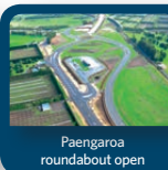
Paengaroa roundabout open