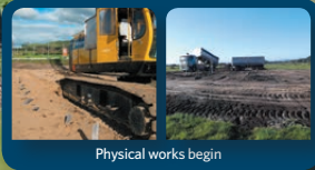
Physical works begin