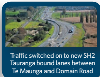
Traffic switched on to new SH2 Tauranga bound lanes between Te Maunga and Domain Road