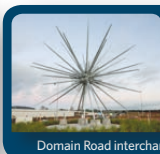
Domain Road interchange artworks completed