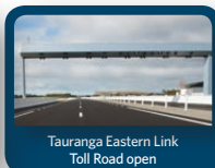
Tauranga Eastern Link Toll Road open