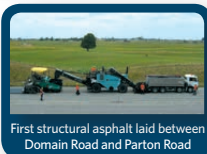
First structural asphalt laid between Domain Road and Parton Road