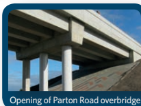
Opening of Parton Road overbridge