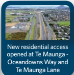
New residential access opened at Te Maunga-Oceandowns Way and Te Maunga Lane