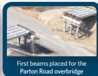
First beams placed for the Parton Road overbridge