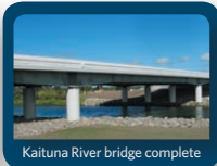
Kaituna River bridge complete