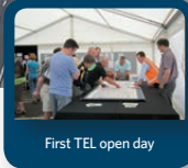
First TEL open day