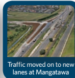
Traffic moved on to new lanes at Mangatawa