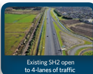
Existing SH2 open to 4-lanes of traffic