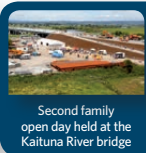
Second family open day held at the Kaituna River bridge