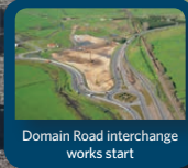
Domain Road interchange works start