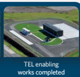
TEL enabling works completed