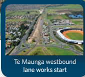
Te Maunga westbound lane works start