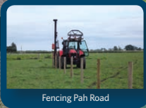
Fencing Pah Road