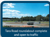
Tara Road roundabout complete and open to traffic