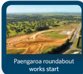
Paengaroa roundabout works start