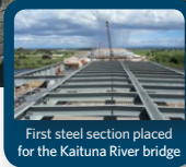
First steel section placed for the Kaituna River bridge