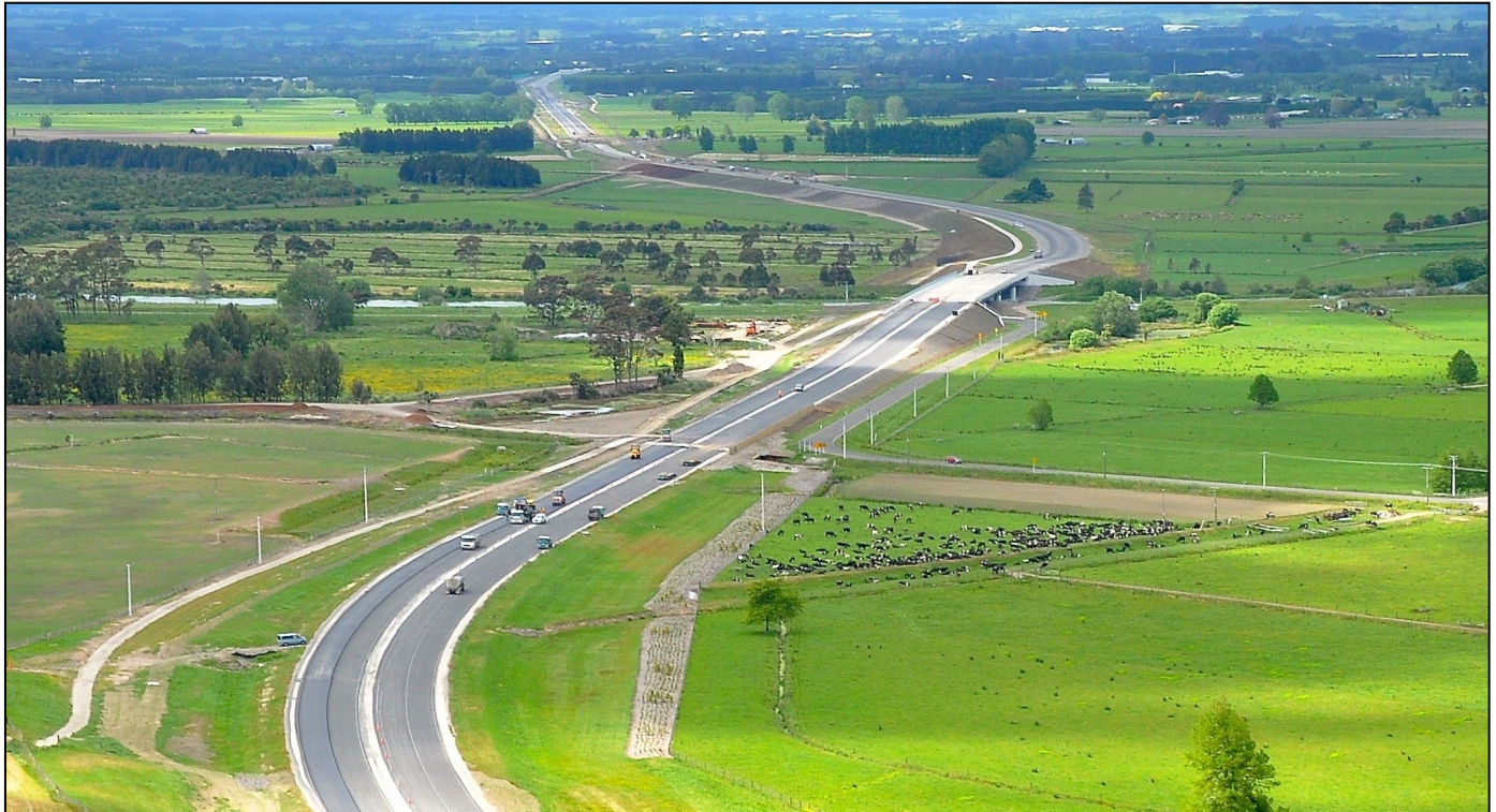
Above: Eastbound on the TEL, Bell Road and Kaituna River bridge in the foreground, through to the Maketu Road bridge in the distance