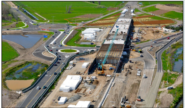
Above: Domain Road interchange