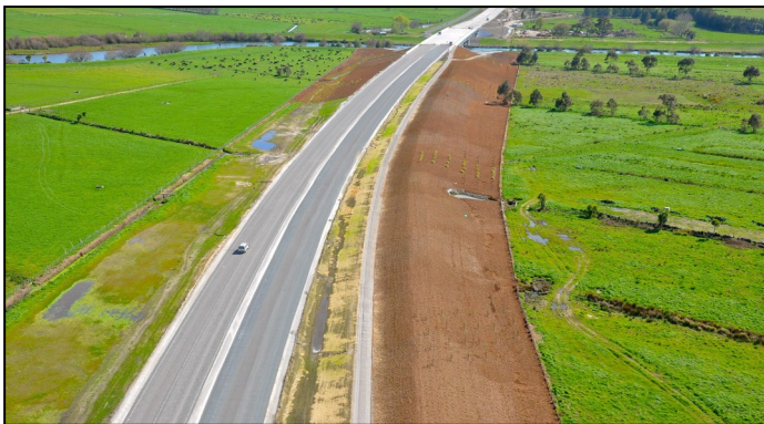
Above: Pah Road to Kaituna River bridge cycleway and noise bund.