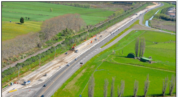
Above: SH2 westbound lanes