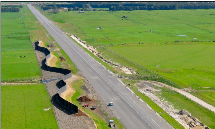
Above: Noise wall and stock underpass