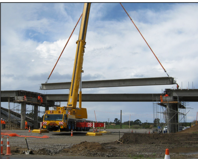
Above: Parton Road bridge central span beam lift