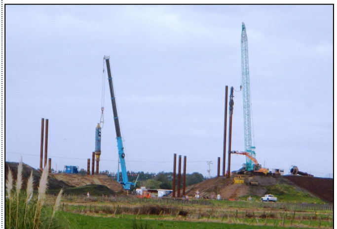
Above: Parton Road bridge site