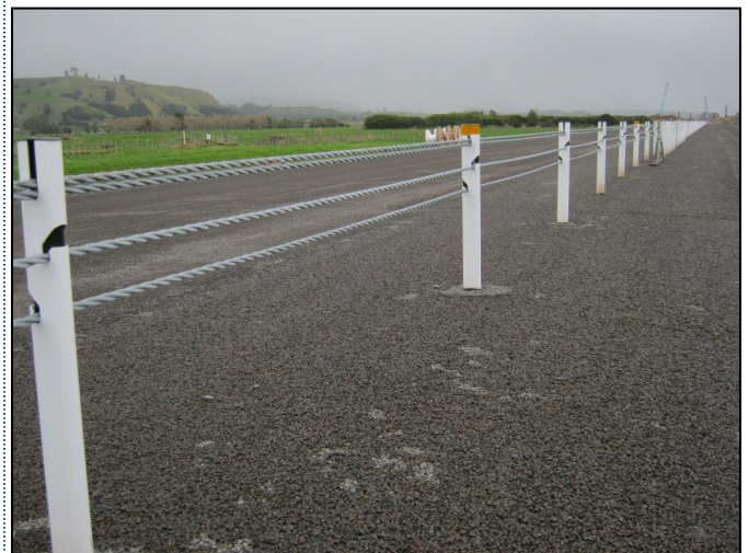
Above: Wire rope barrier installation