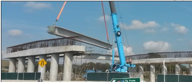
Above: First beam lift in early April