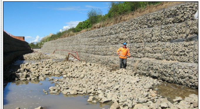
Above: Mangatawa drain gabion basket drain strengthening