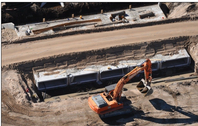
Above: The culverts at the halfway stage

At 34.3 metres long and a total of 24.9 metres wide, the Rangiuru culverts are the largest bank of culverts to be constructed on the TEL.