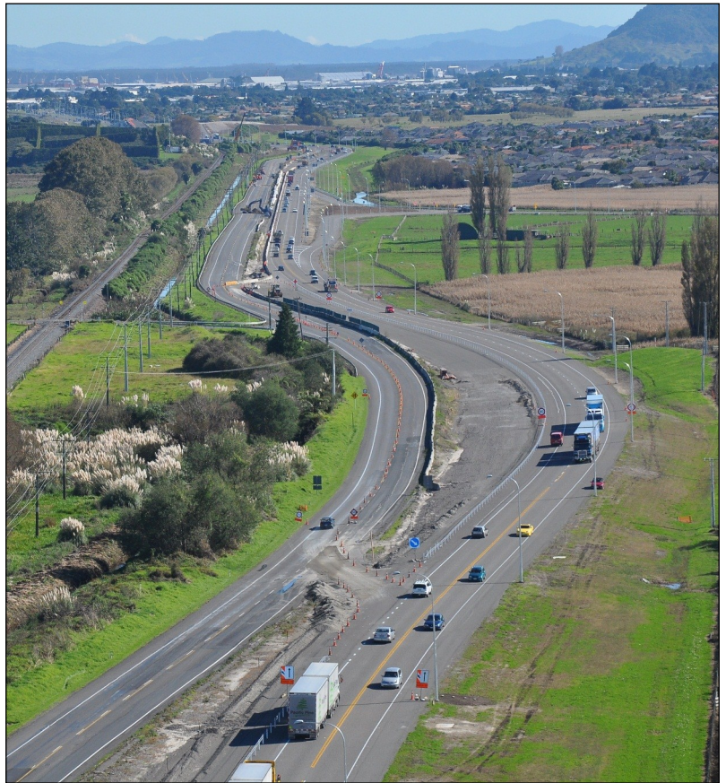
Right: Traffic on the new TEL east bound lanes and the temporary Kairua Road off ramp

Stage two works can now commence with the removal of the old State Highway 2 to allow the placement of structural fill and surcharge material for the west bound lanes, construction of the new Kairua Road on and off ramps, road side swales and a storm water retention pond.