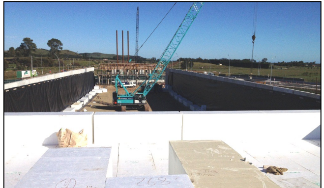
Above: Domain Road interchange works