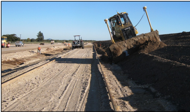
Above: Topsoil being placed on the noise bund next to the cycle path

The Kaituna River wetland noise bund is 1700 metres long and three metres in height above the road with the cycle path at it's base. Once the topsoil and mulch has been placed, the landscaping crews will plant a variety of plants which will include Kahikatea, Kowhai and Manuka.