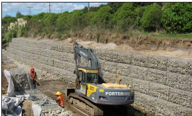
Above: Mangatawa drain strengthening work