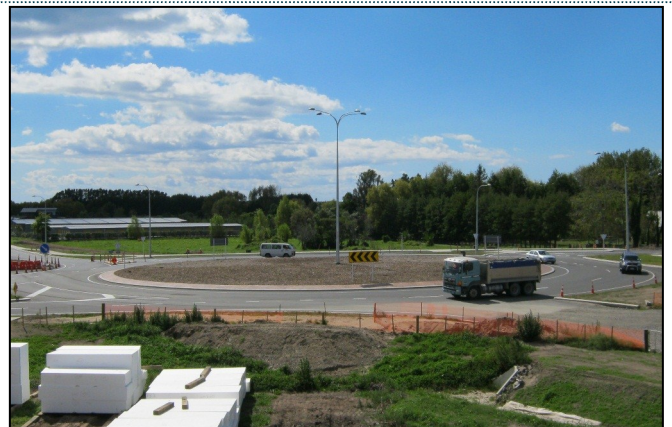
Above: Tara Road / Domain Road roundabout completed