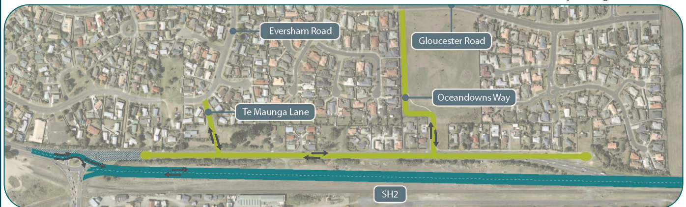
Below: New residential access lanes and road layout changes.

All residents and visitors will be required to use the new access lanes from Monday 5 August.