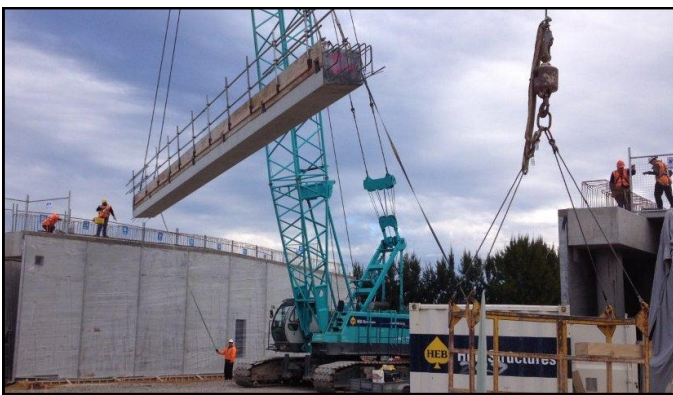
Above: The first beam being lifted.

It took two days only to lift 21 concrete beams into place to create the superstructure for the Maketu Road bridge. Each beam weighed between 27 to 30 tonne and were 21 metres in length.