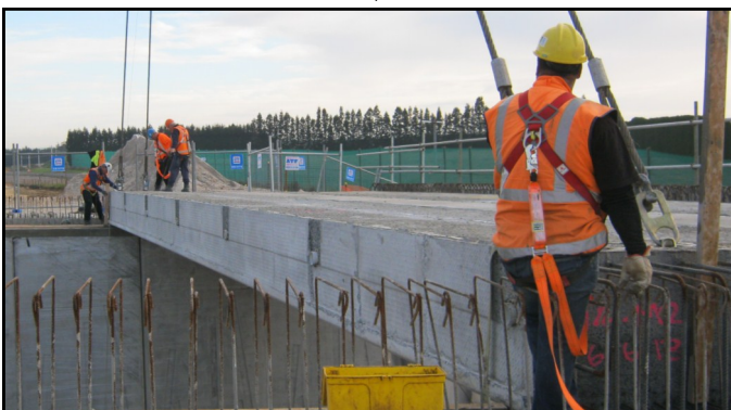
Below: One of the beams lifted into it's final position.

The bridge deck will now be constructed, and soon the earthworks and pavement teams will commence the re-construction of Maketu Road, which will be re-opened later in 2013.