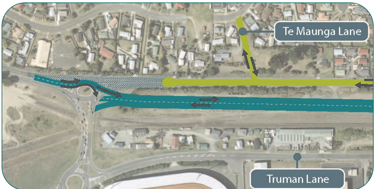
Above New road layout changes at the Te Maunga roundabout

For this switch to occur, work will be carried out from Sunday afternoon through the night until early Monday morning. At times, temporary traffic management will be in place on State Highway 2. All motorists and Te Maunga SH2 residents are asked to take extra care and to follow any detours in the area during this time. This work is very weather dependent and may be carried out on the next suitable day.