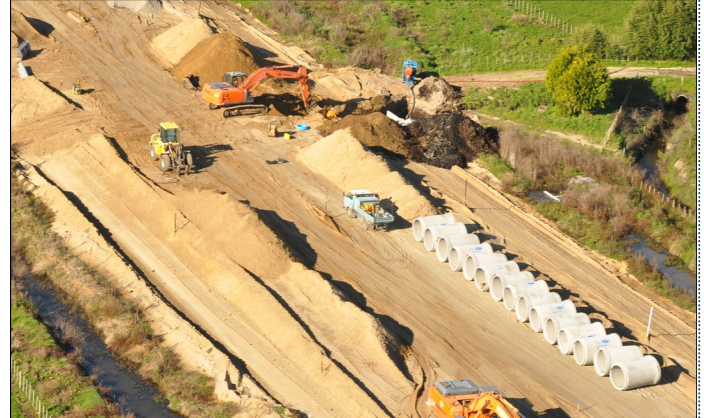
A 1500mm culvert

Significant progress has been made on the TEL over the past few months, much of which isn't seen easily from the ground. These aerial shots taken last week show the Kaituna River bridge (above) now connected to the embankments allowing construction traffic to cross and the East Coast Main Trunk rail line (below) with concrete deck beams in place.