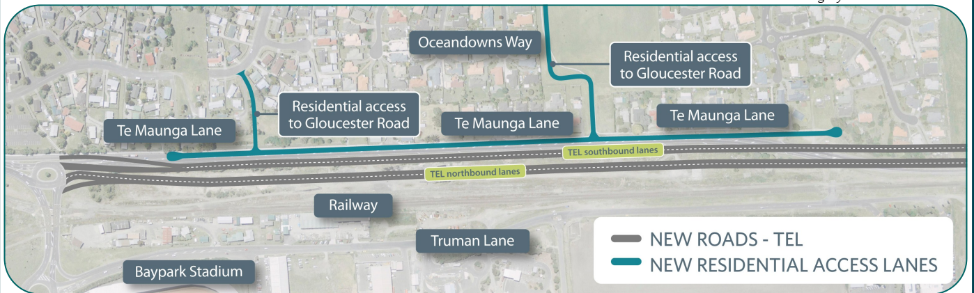
Below: New residential access lanes and the final roading layout.