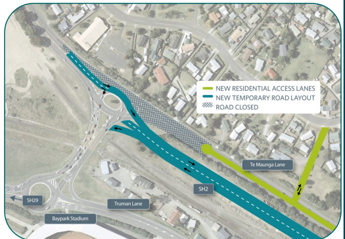
Above: The first stage traffic switch with the slip lane closed.

All residents will be required to use the new access lanes.