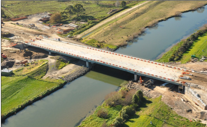
Kaituna River bridge