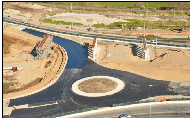
Domain Road Interchange temporary roundabout

Significant progress has been made on the TEL over the past few months, much of which isn't seen easily from the ground. These aerial shots taken last week show the Kaituna River bridge (above) now connected to the embankments allowing construction traffic to cross and the East Coast Main Trunk rail line (below) with concrete deck beams in place.