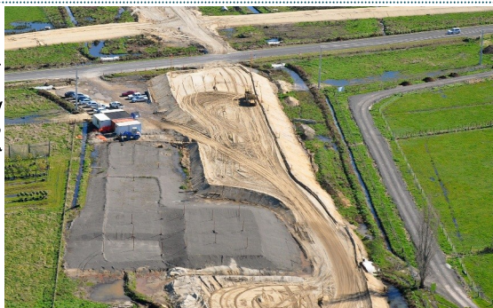
Right: Zone B— Parton Road bridge embankment