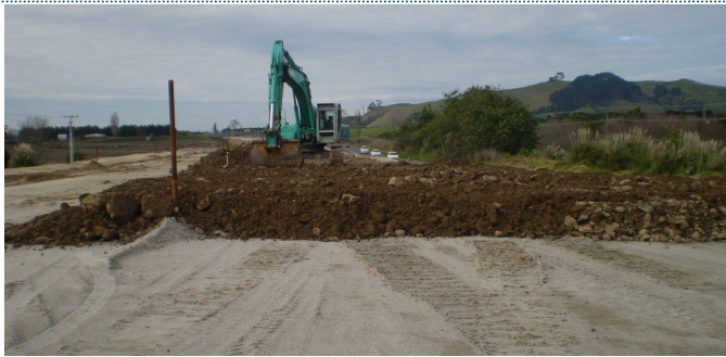
Zone A—Pre-load rubble adjacent to State Highway 2