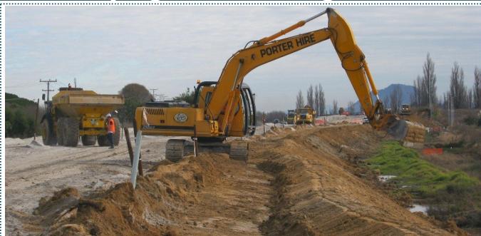
Zone A—Tephra encapsulation on the pumice fill