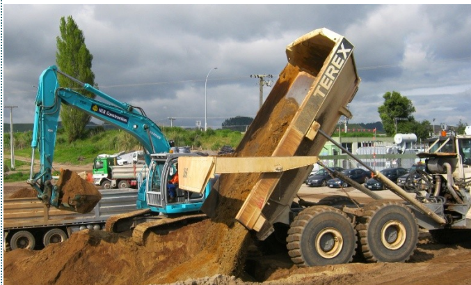
Domain Road off-load and re-load operation, minimising the need to use local roads