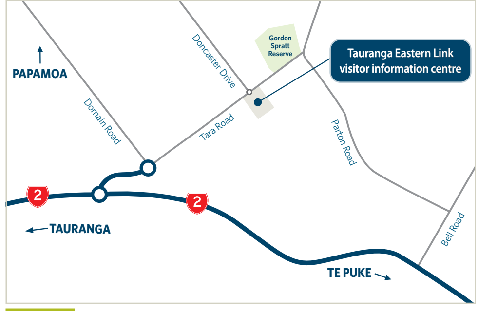
TEL visitor information centre at 65 Tara Road