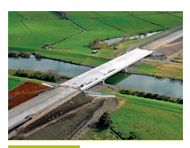
Kaituna River bridge and Bell Road 2014