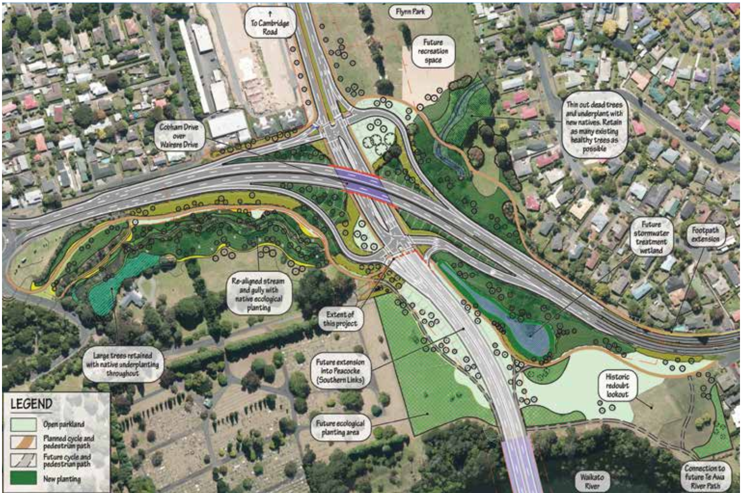
Plan of the new Cobham Drive/Wairere Drive intersection