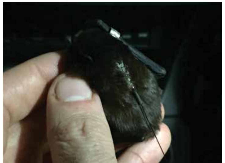
Bat with tracking device attached