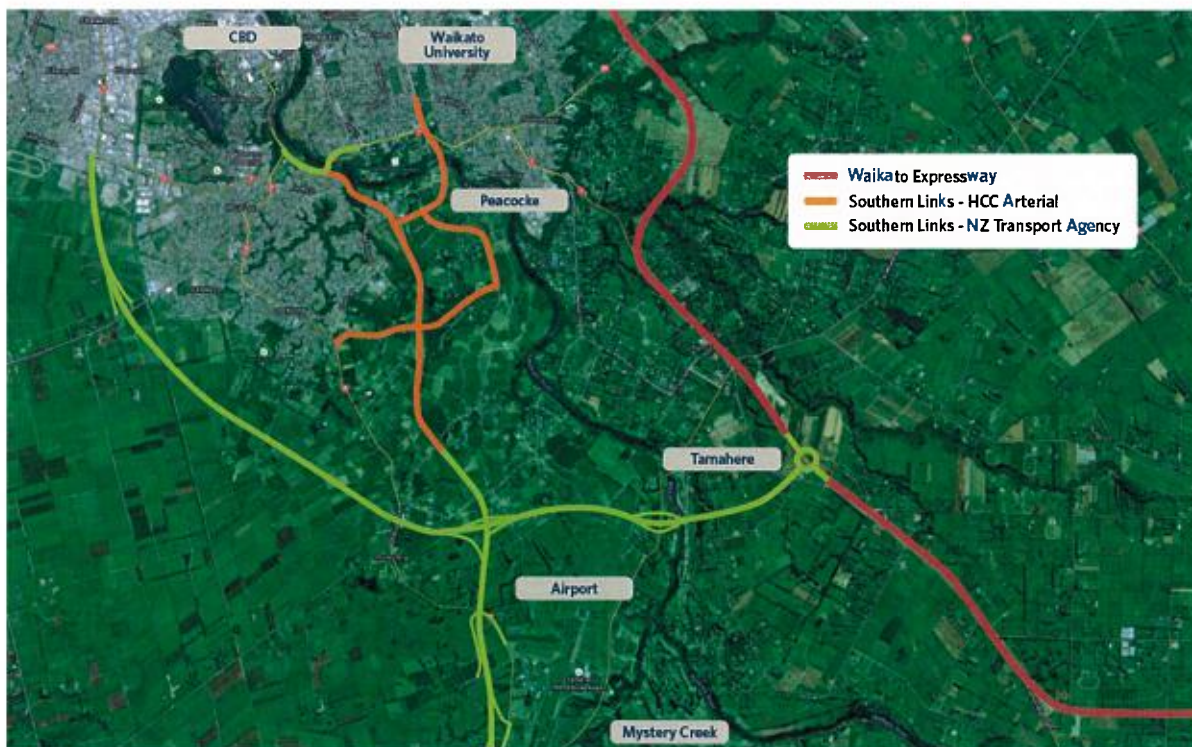
Figure 1: Southern Links Network

Southern Links will also complement the Waikato Expressway by providing the main southern access linking Hamilton city and the Expressway.