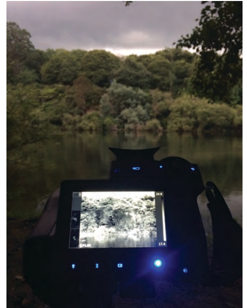
Thermal imaging camera

To sign up for these newsletters online go to www.nzta.govt.nz/southernlinks