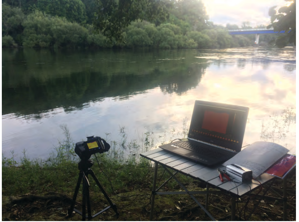
Bat monitoring near Cobham Drive

The team is now focusing on analysing and assessing the data they have gathered. They'll be out again next season to do more bat monitoring work.