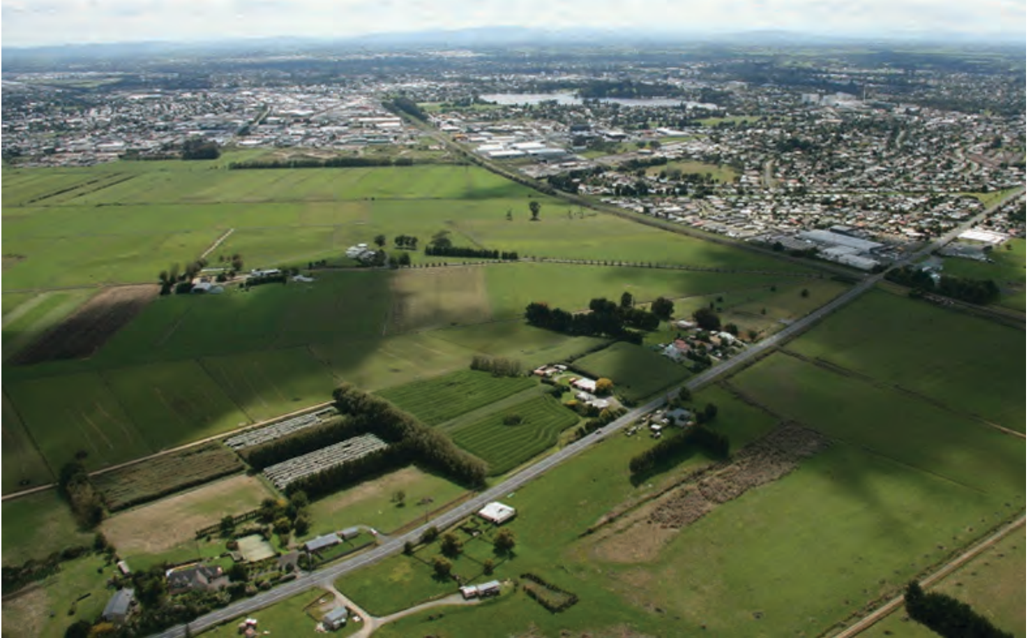
Hamilton City with Collins Road in the foreground