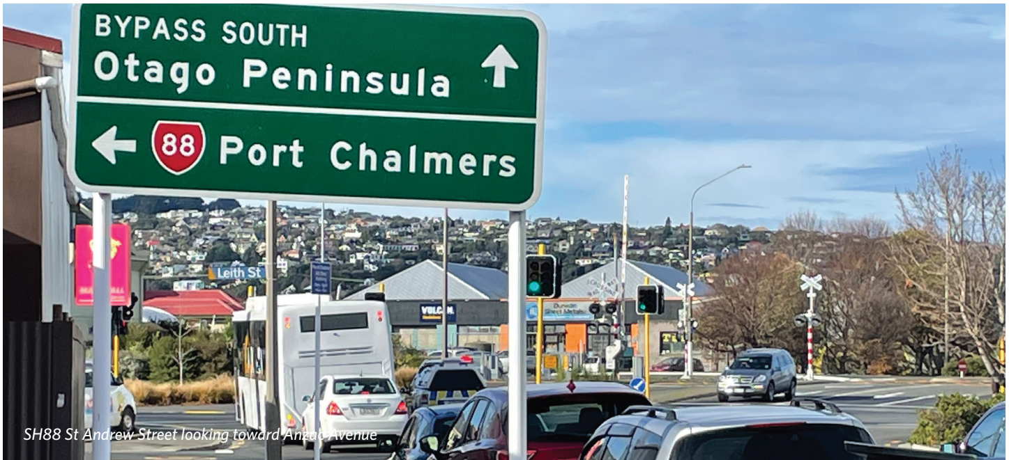
SH88 St Andrew Street looking toward Anzac Avenue