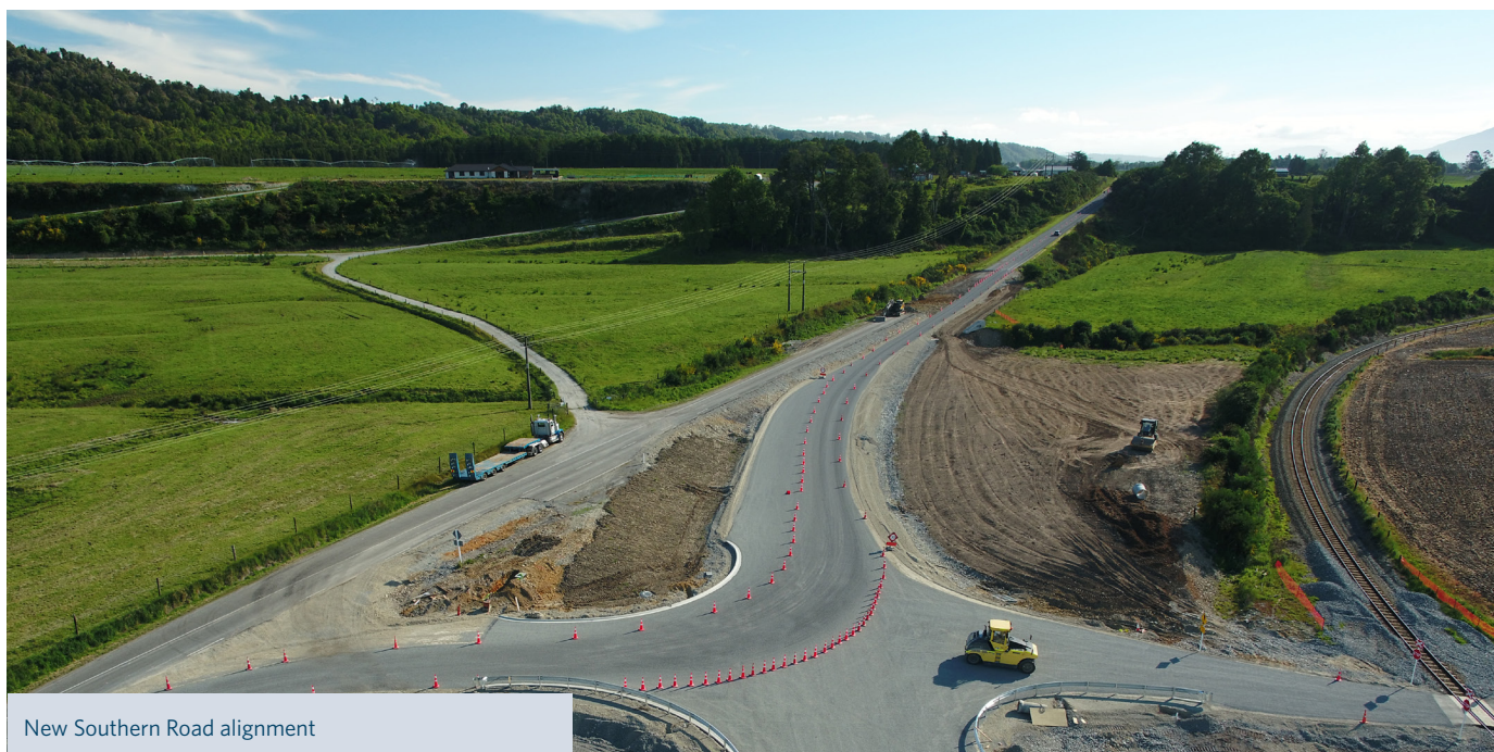
New Southern Road alignment