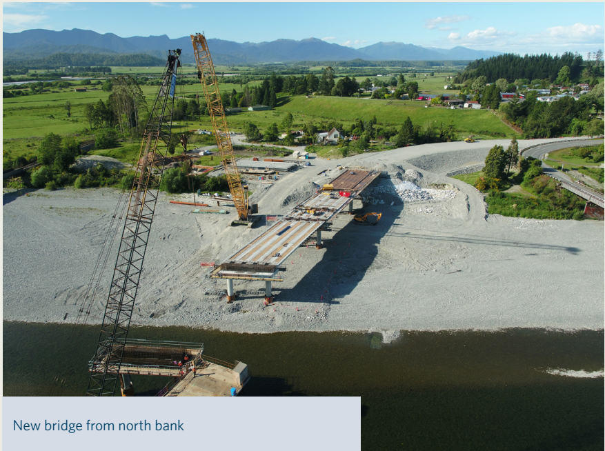
New bridge from north bank