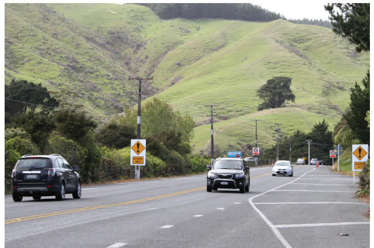
View southbound from Harris Road