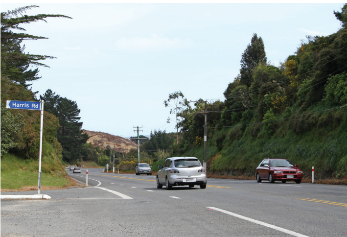
View northbound from Harris Road

You can have your say about these proposals a number of ways. See the 'How to have your say' section on the back page of this brochure for more information.