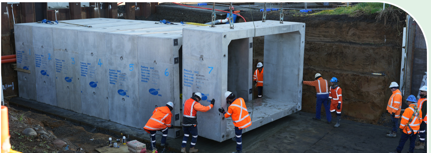
The crew making sure the concrete walls line up perfectly