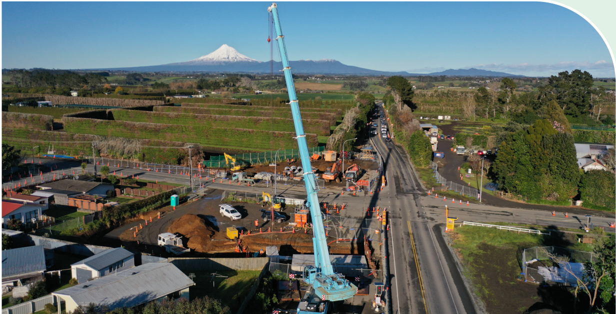
Crane being used to install concrete walls for the pedestrian underpass