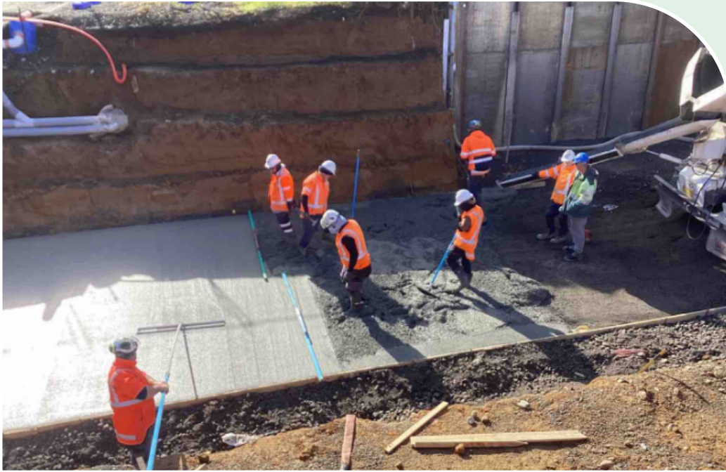
The crew laying base layer of concrete for underpass path