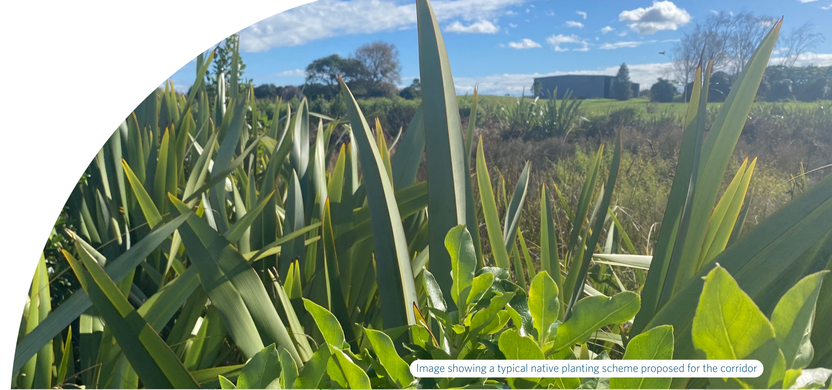
Image showing a typical native planting scheme proposed for the corridor

The environment - te taiao - is a key consideration as part of the transport upgrade to State Highway 22. A plan for landscape and urban design is currently being developed in partnership with Mana Whenua.