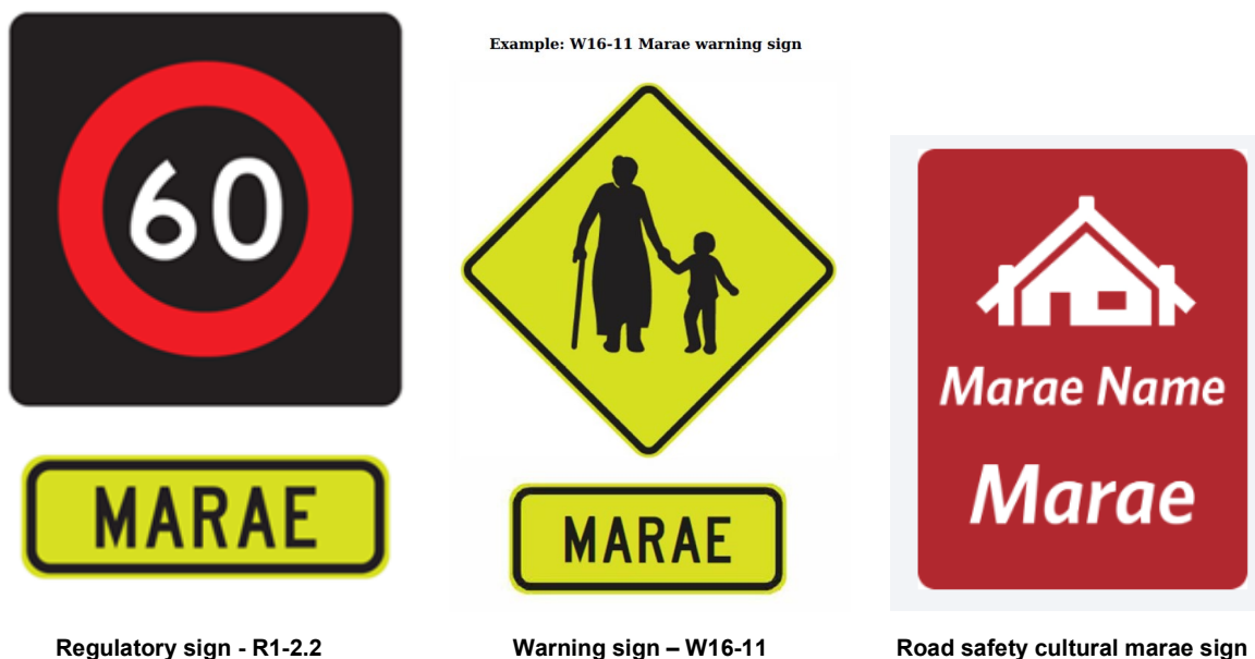
Figure 1: Marae signage

The available signs consist of three types of signage: