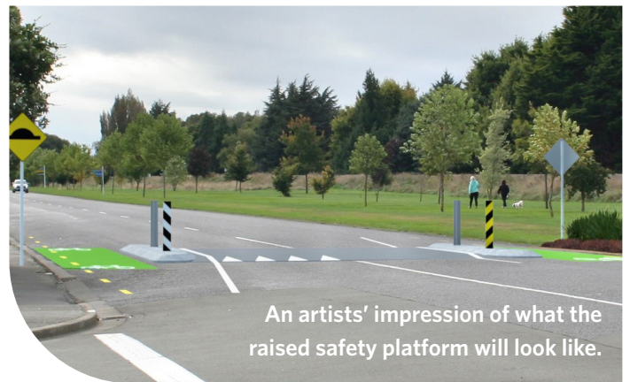
An artists' impression of what the raised safety platform will look like.

Once the first stage is complete, work will shift to other parts of Tinwald. Raised safety platforms will be installed on Melcombe St as well as cycle-separator strips and new road markings. Improvements will also be made to the viaduct, including a new footpath and a pedestrian refuge.