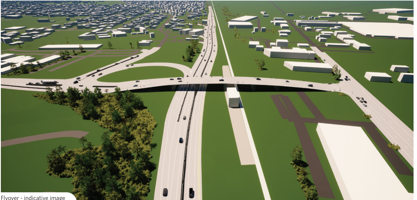
Flyover - indicative image

We're talking with directly affected people about property impacts and access.