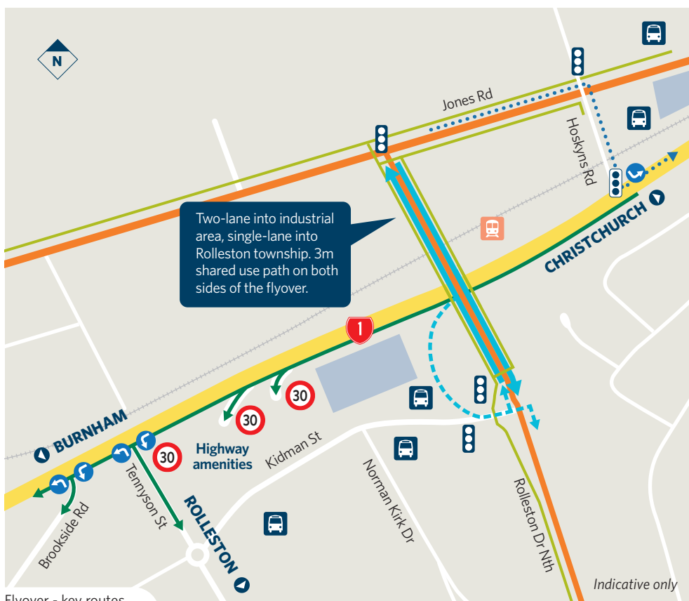
Flyover - key routes