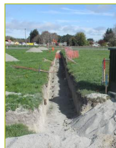
Above: Work that is being carried out on the Waterloo Business Park site.

Works have begun with removing trees on Main South Road and Orion has partly completed work to underground the power lines. We will begin installing new storm water and wastewater main pipes, a new wastewater pump station, kerb and channel, and then road upgrades. Traffic signals will be installed at the new Pound Road and Main South Road intersection, as well as shared paths for pedestrians and cyclists.