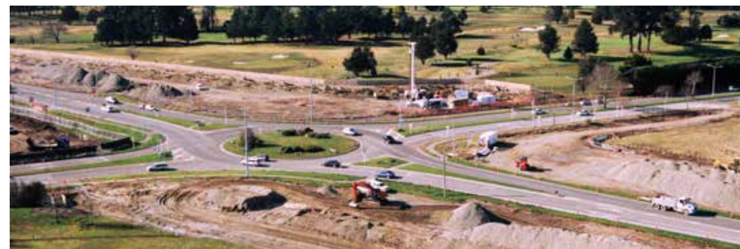
Building the slip lanes at the Russley/Memorial intersection

A partnership of the NZ Transport Agency, the Christchurch City Council and Christchurch International Airport Limited ran an urban design competition to develop the design concept for this bridge.