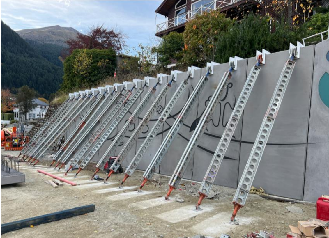
Some of the 58 large decorative panels being installed along Henry Street.