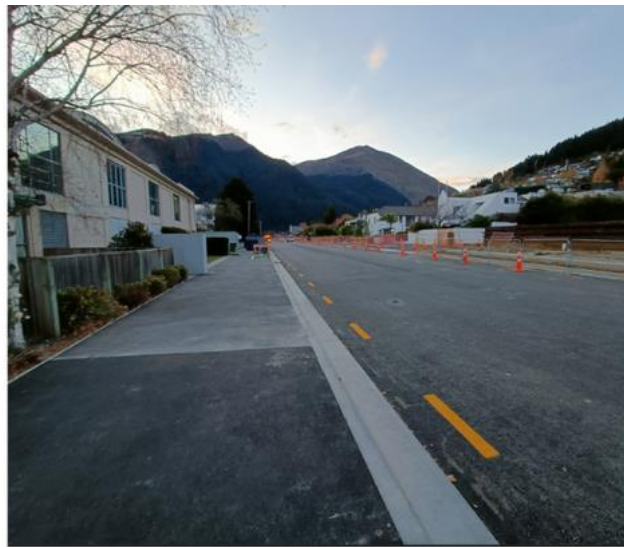
Left, a bird's eye view of the asphalt being laid on Melbourne Street, and right, at street level.

Our work on the lakeside of Frankton Road is also progressing well, with the focus moving from linking up the stormwater crossings to kerb and footpath preparations on lower Suburb Street and Veint Crescent.