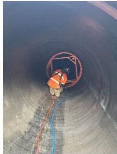
Large trenches are needed for the new 1.4m diameter stormwater pipes.