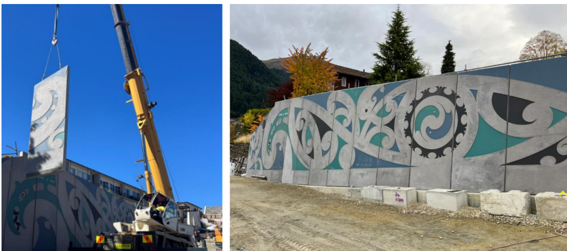
The Ballarat Street precast concrete panels were installed with millimetre-precision.