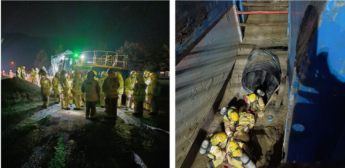
A number of FENZ personnel benefited from the exercises in our stormwater trench.

Earlier this month, Fire and Emergency NZ (FENZ) worked with Kā Huanui a Tāhuna to run training exercises at our SH6/6A work site. One of the drills focused on increasing crew members’ experience operating in confined spaces, with volunteers from the Queenstown station using the stormwater pipes being installed to extract an ‘injured’ worker. In a second drill, they entered the trench to test the protocol for a gas leak.