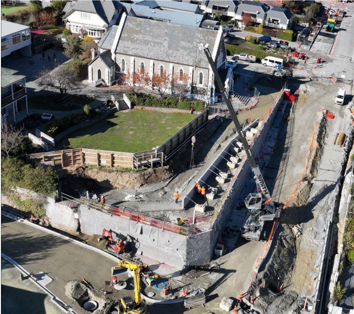
The St Joseph’s School field will be remediated once backfilling is complete.

The wall adjacent to St Joseph’s School and Church is also progressing well with concrete pouring and backfilling underway. Recently our team worked with St Joseph’s School to widen an entranceway making it safer and easier for people to get to the annual Book Fair.