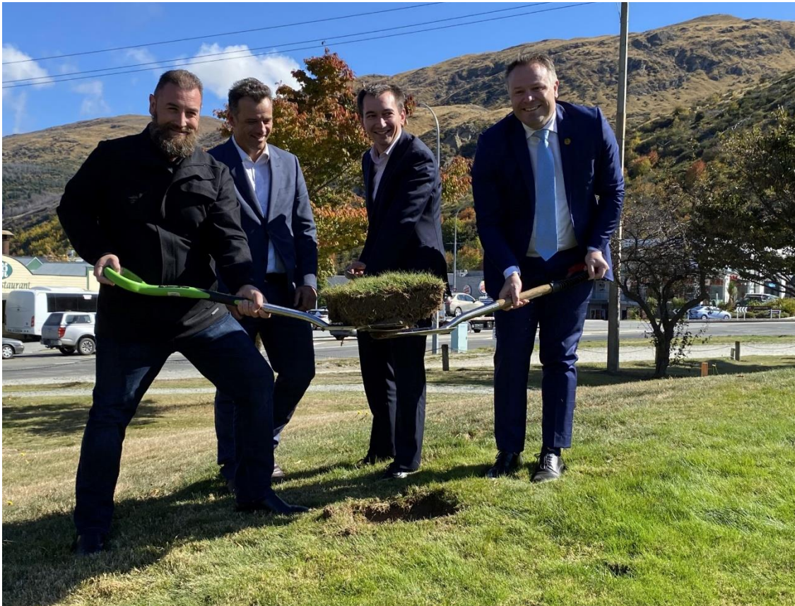
L-R: Te Rūnanga o Ngāi Tahu Kaiwhakahaere Justin Tipa, MP for Southland Joseph Mooney, Minister of Transport Hon Simeon Brown, and QLDC Mayor Glyn Lewers mark the beginning of construction.