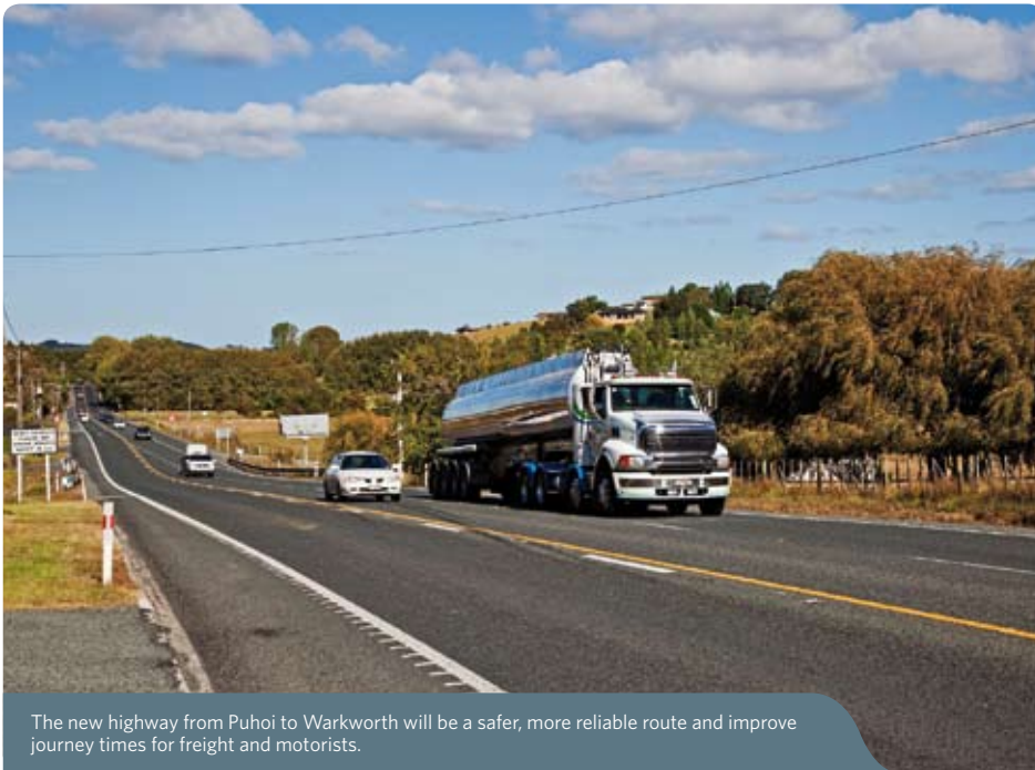
The new highway from Puhoi to Warkworth will be a safer, more reliable route and improve journey times for freight and motorists.

NZTA to progress with consents and designation applications