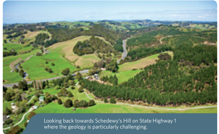
Looking back towards Schedewy's Hill on State Highway 1 where the geology is particularly challenging.

Developing the new route and preparing the consent applications and statutory processes will occur during 2011 and 2012. It may take up to a year to gain approval for the new highway once applications are lodged with the consenting authority.