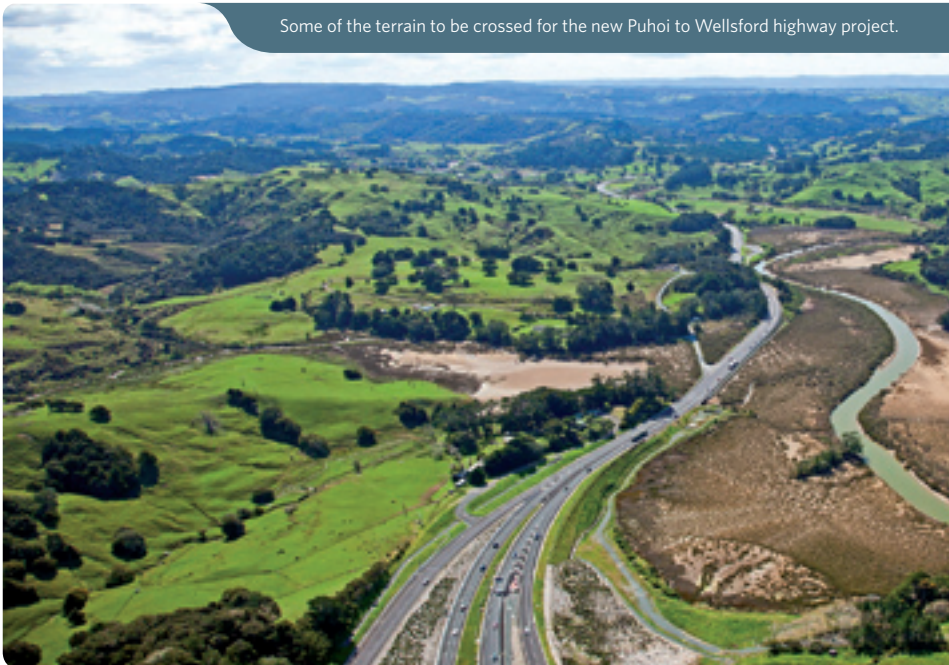
Some of the terrain to be crossed for the new Puhoi to Wellsford highway project.

The indicative route is a result of seven months of in-depth specialist work assessing environmental, social and engineering inputs which includes getting your feedback in consultation phase one. This investigation will continue to occur over the next few months as we develop the indicative route and get comments back from you and your community.