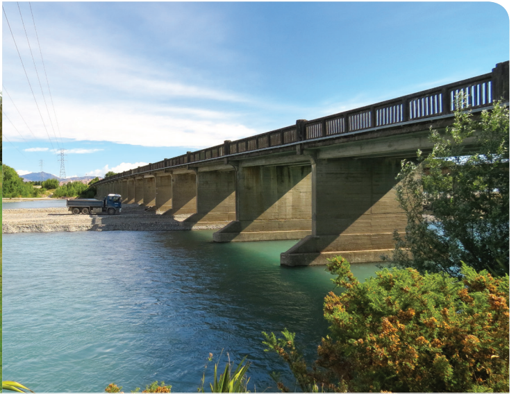
Wairau River Bridge