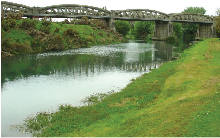
Opawa River Bridge