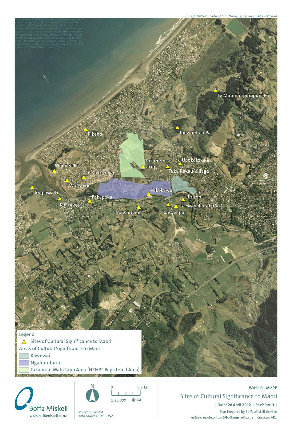
Figure 14.1: Sites and Areas of cultural significance to Māori within the Project area