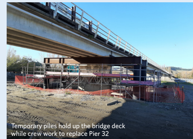
Temporary piles hold up the bridge deck while crew work to replace Pier 32

Repairs are continuing on the Waiau Bridge, with some weekend night closures. The next closures are scheduled for Saturday 20 (8pm-8am) and Sunday 21 June (6pm-6am). Further dates to be confirmed. If you would like to receive weekly email updates on this work, email us at info@nctir.com or call us on 0800 628 4737 .