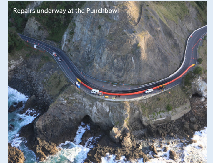
Repairs underway at the Punchbowl

Repairs are underway on a small 15-metre section of seawall at the Punchbowl that was damaged during the earthquake. The existing traffic management in place around Tunnel 11 has been extended north to include the work that has started on the Punchbowl point. Temporary traffic lights will be operating overnight.