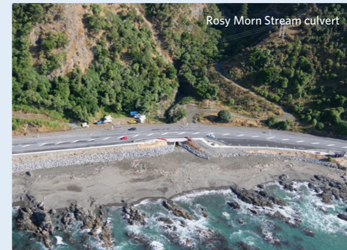
Rosy Morn Stream culvert

Opposite Raramai Safe Stopping Area, on the inland side of SH1, work has started on a Debris Flow Interception Wall at the Rosy Morn Stream culvert. This is designed to stop debris entering and blocking the culvert under the road.