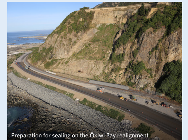
Preparation for sealing on the Ōkiwi Bay realignment.

Sealing work is set to get underway on the Ōkiwi Bay road realignment, just north of Black Miller Stream. This will be undertaken in two sections, starting with the southern end this week and the northern end the following, weather permitting. One-lane traffic management will be in place around this site, which is approximately 800 metres in length, allowing traffic to continue moving while the opposite lane is being sealed. Once sealing is complete, crews will line-mark the road and start installing guardrail.