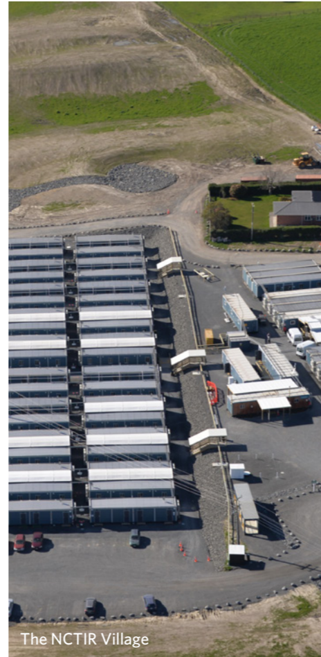
The NCTIR Village

As a result of the shutdown due to Covid-19 and its impact on our programme, Waka Kotahi NZ Transport Agency will retain the Kaikōura Village for a further period. We're reviewing how the recent shutdown and reduced capacity return will impact the project's completion date, but we will provide an update when we can.