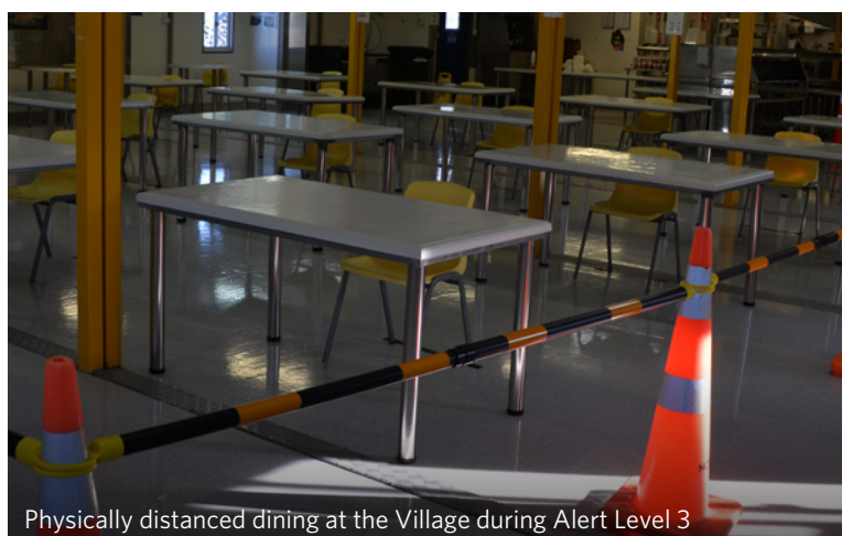
Physically distanced dining at the Village during Alert Level 3