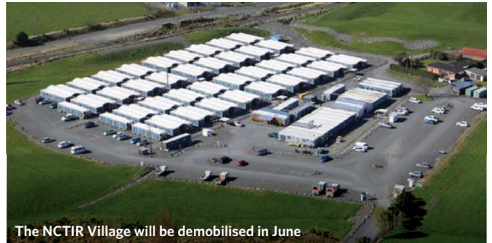
The NCTIR Village will be demolished in June

If you would like the opportunity to come and see our home away from home before it goes, we'll be holding a NCTIR Open Day at the Village on Sunday 22 March between 11 – 2pm. This will include a project update, as well as food and family-friendly activities.