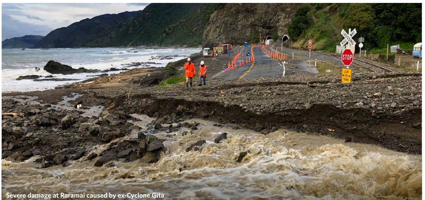
Severe damage at Raramai caused by ex-Cyclone Gita

See the map on page 2 for a full overview of all major Gita work.