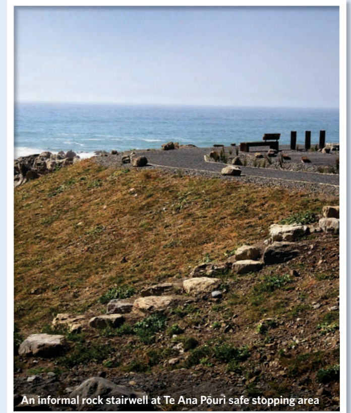
An informal rock stairwell at Te Ana Pōuri safe stopping area

*The RLG was established in 2017 to provide a forum for the NCTIR alliance to collaborate with key stakeholders including iwi, central and local government, and local community groups.