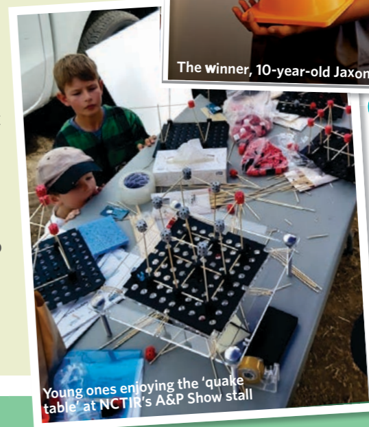
Young ones enjoying the 'quake table' at NCTIR's A&P Show stall