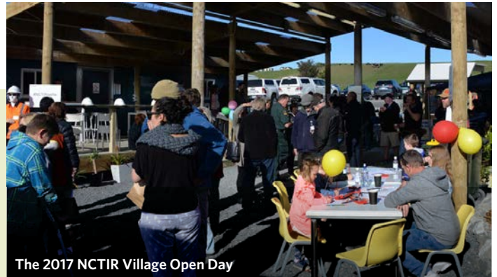
The 2017 NCTIR Village Open Day