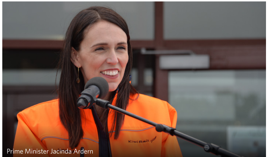
Prime Minister Jacinda Ardern

The Prime Minister, Government VIPs, tourism chiefs, earthquake recovery workers, Kaikōura locals and iwi celebrated a special commemorative train that arrived in Kaikōura on Friday 23 November. For the first time since it was devastated by the Kaikōura earthquake two years ago, passengers travelled on the Main North Line between Picton and Christchurch for the celebration event. At the event Prime Minister Jacinda Ardern, who travelled on the train, announced funding from the Government’s Provincial Growth Fund that will allow KiwiRail to expand Coastal Pacific services.