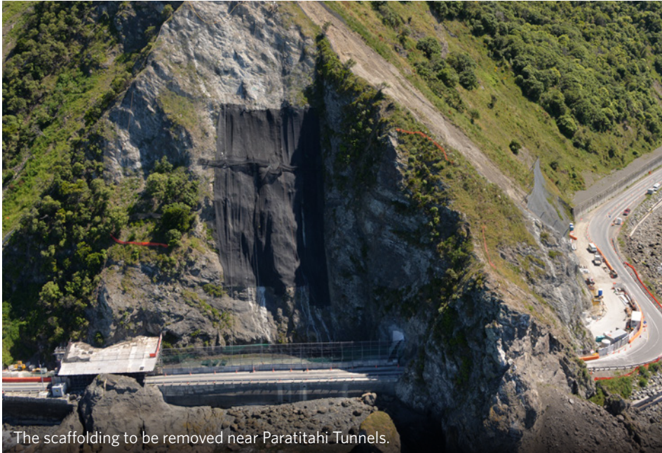
The scaffolding to be removed near Paratitahi Tunnels.

After many months of slope protection work, the scaffold tunnel near the Paratitahi Tunnels is now ready to be removed. The scaffold has been in place as a rock fall shelter protecting the road from the slope works above. For safety measures the removal of the scaffold requires the road to be closed and to reduce the impact for road users this will be undertaken at night. To minimise the disruption to the travelling public we will reopen the road every 90 minutes for 30 minutes during the night closure. Please refer to the timetable of openings and closures below.