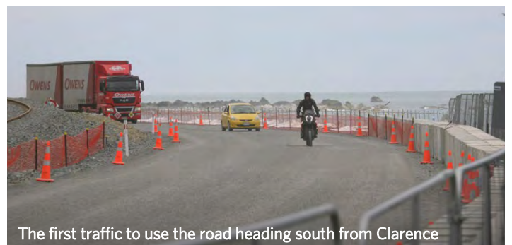
The first traffic to use the road heading south from Clarence