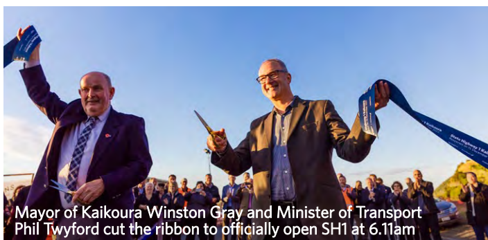
Mayor of Kaikoura Winston Gray and Minister of Transport Phil Twyford cut the ribbon to officially open SH1 at 6.11am