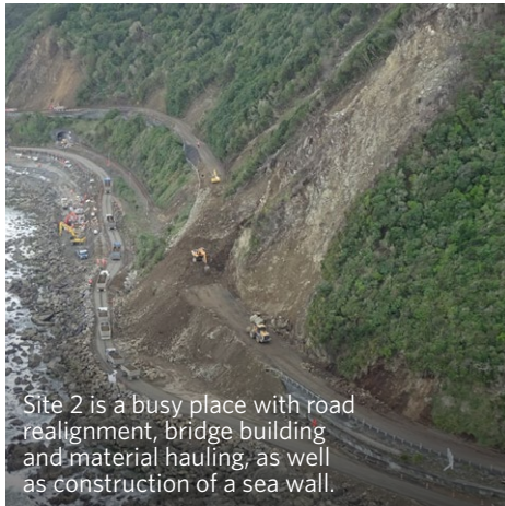
Site 2 is a busy place with road realignment, bridge building and material hauling, as well as construction of a sea wall.