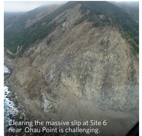
Clearing the massive slip at Site 6 near Ohau Point is challenging.