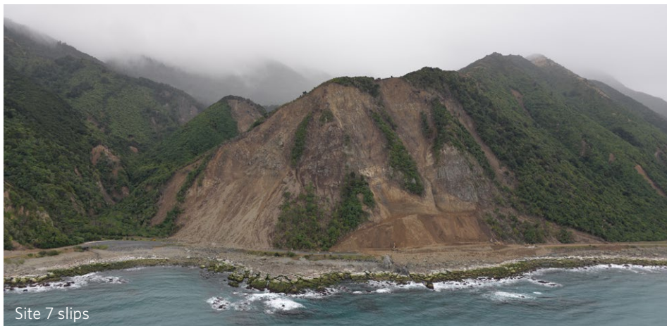
Site 7 slips