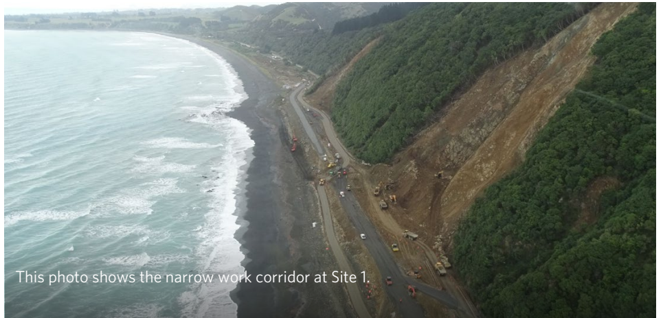
This photo shows the narrow work corridor at Site 1.

The following photos show the progress being made on clearing the slips north of Kaikoura. It also shows the narrow corridor in which the work has to take place. At some of the sites, this work includes building sea walls, clearing slip material, building bridges and roads all at the same time.