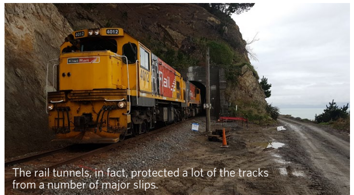
The rail tunnels, in fact, protected a lot of the tracks from a number of major slips.

Always slow down as you are approaching a level crossing and be prepared to stop.