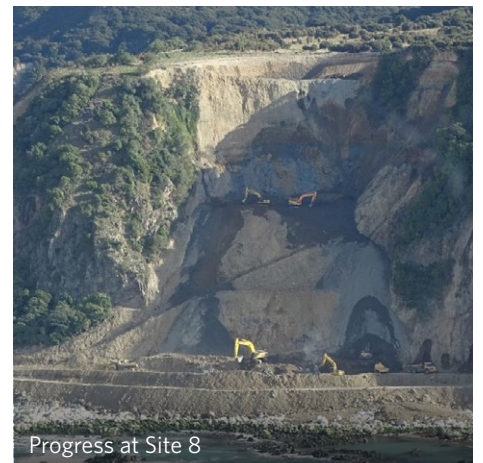
Progress at Site 8